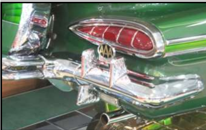
Elegant etched chrome accents the 1959 Chevy’s bumper & tire cover