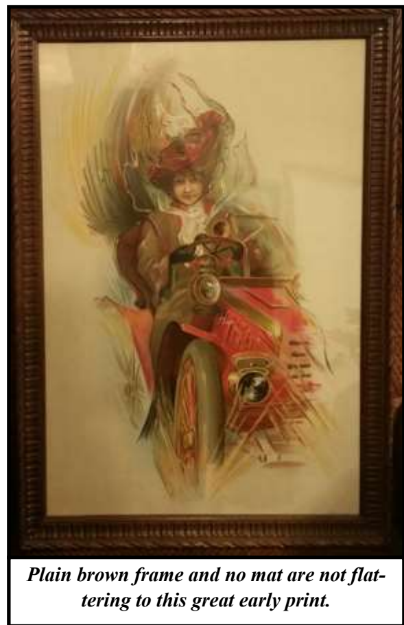
Plain brown frame and no mat are not flattering to this great early print.

Professional framing can be very expensive. Several items in my collection that have been professionally