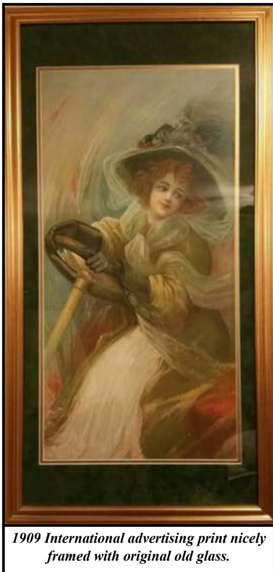
1909 International advertising print nicely framed with original old glass.

Other items in my collection I purchased already framed, but there is no accounting for taste, and what someone else thought was “cute” I see as totally unflattering to the work itself.