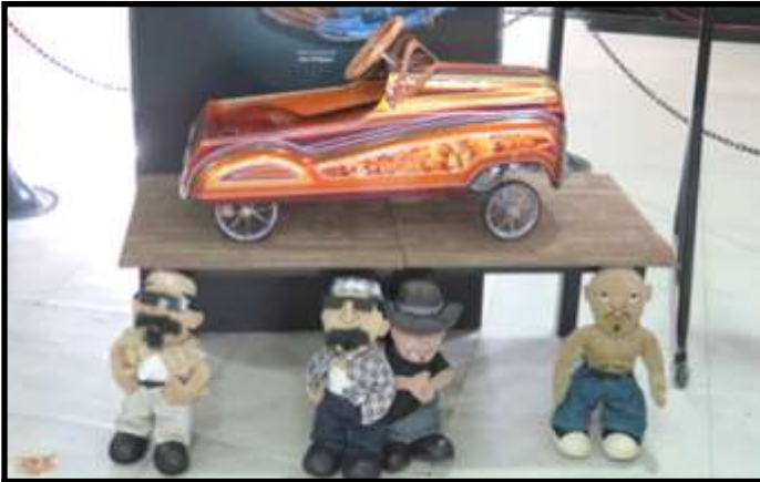
A "lowrider" pedal car display