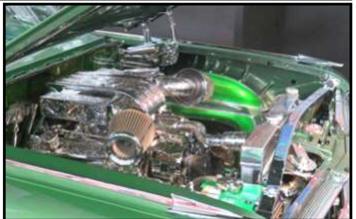
Etched chrome also highlights the 1959 Chevy’s engine compartment