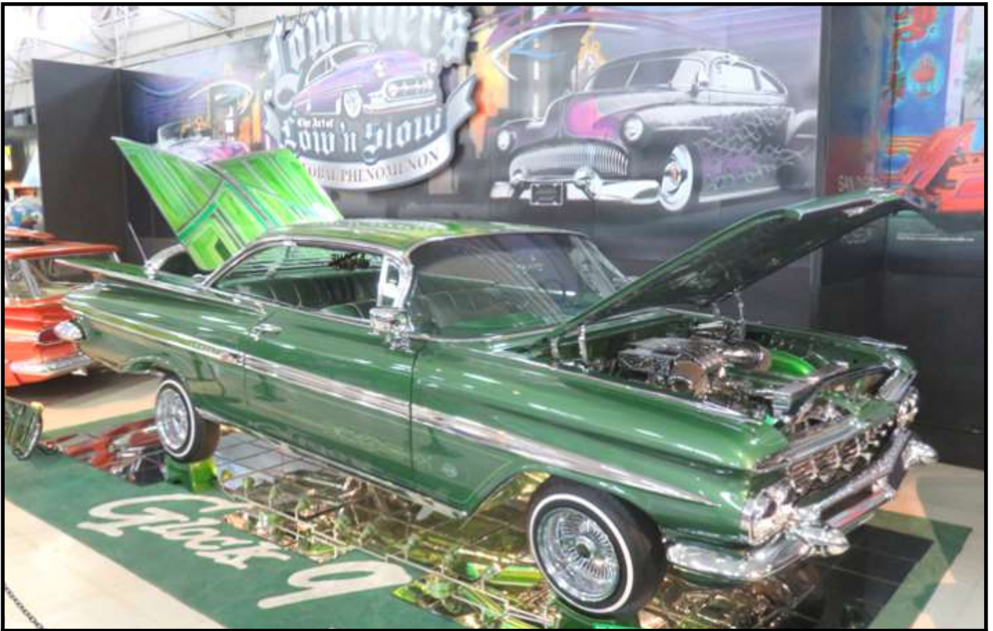
1959 Chevrolet Impala “lowrider”—it represents four years of work and has fully chromed and engraved/etched engine and undercarriage