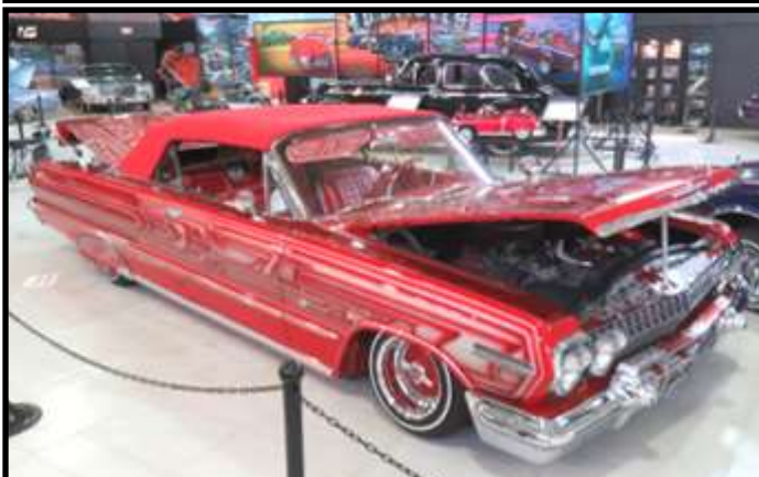
1963 Chevrolet Impala Super Sport—"lowrider"—"Pura Sangre"