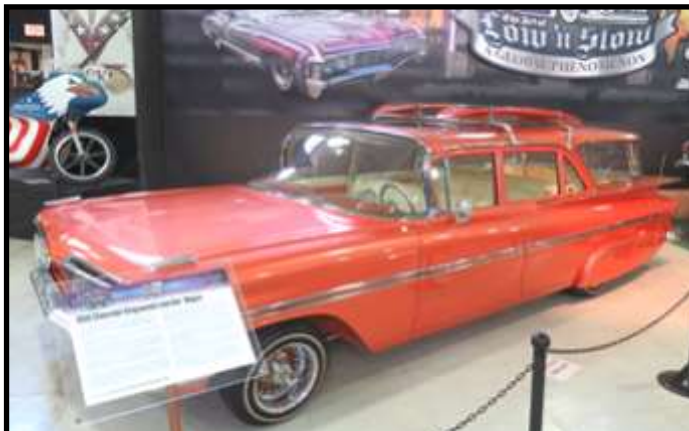
1959 Chevrolet Kingswood station wagon "lowrider"