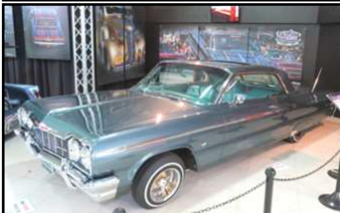
1964 Chevrolet Impala Super Sport "lowrider"—"4Play"