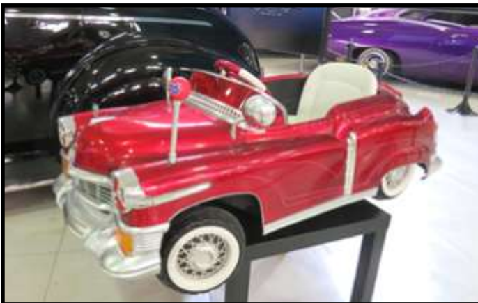
A "lowrider" pedal car—1 of 4 on display