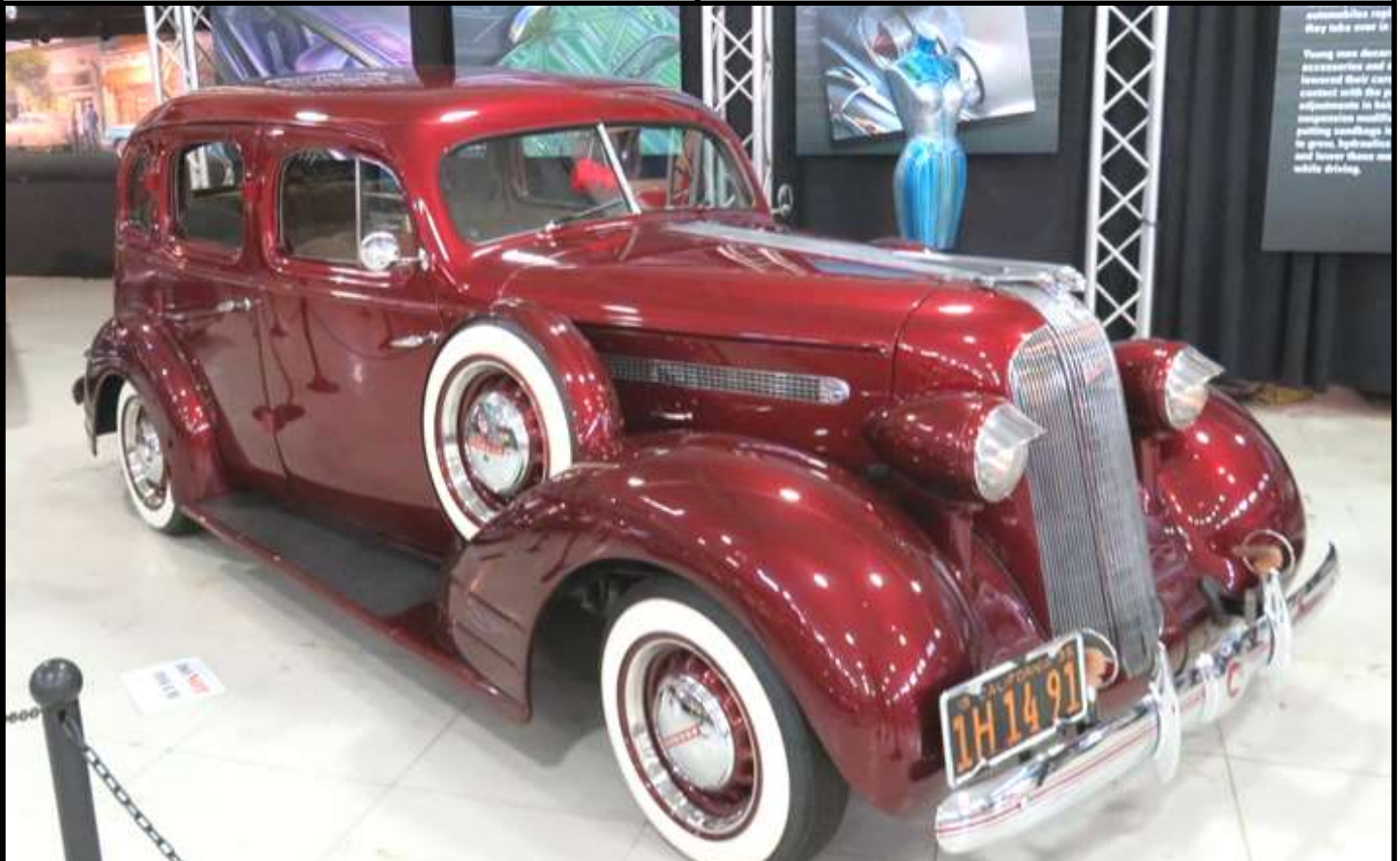
1935 Pontiac Touring Sedan "lowrider"—"Mi Manera" ("My Way"). It doesn't look like a "lowrider," does it?

You don't have to like "lowriders," but you have to appreciate the craftsmanship and engineering. If the builders choose to apply their skills and talent to restoring a vehicle back to original specifications, they'd produce a vehicle qualified to compete for the AACA Zenith Award.