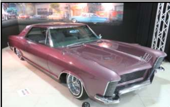
1965 Buick Riviera Sport Coupe "lowrider"—"Spilled Wine"