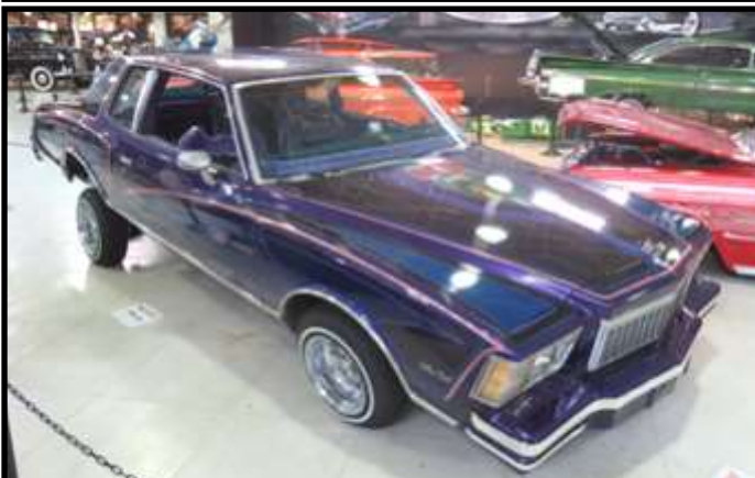
1979 Chevrolet Monte Carlo “lowrider”—“La Muerte” (“The Dead”)