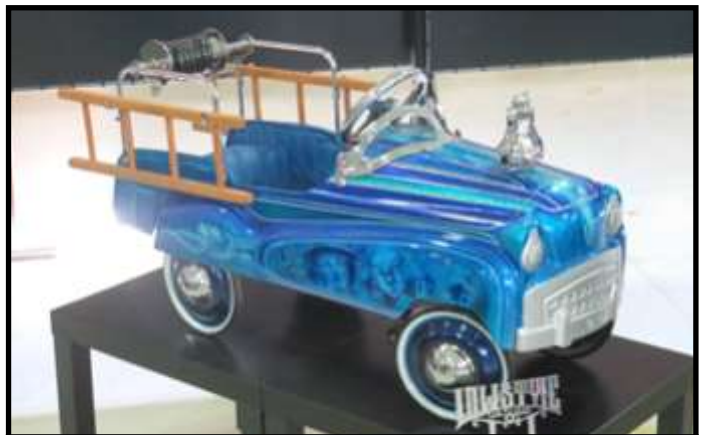
A "lowrider" firetruck pedal car