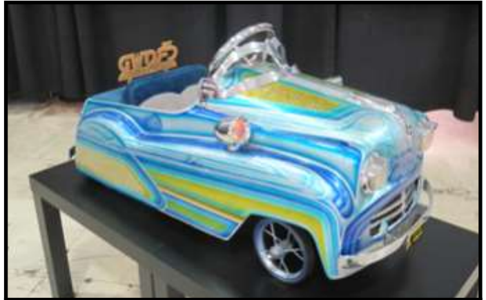
Another "lowrider" pedal car on display at the museum