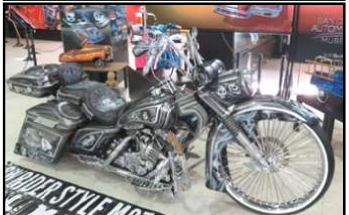
2014 Harley-Davidson “lowrider” motorcycle— “Evil Mistress”