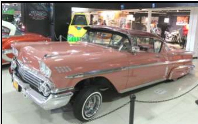
1958 Chevrolet Impala "lowrider"