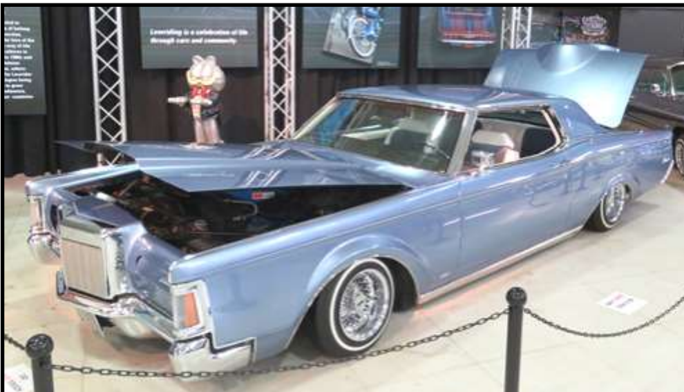
1971 Lincoln Continental MKIII "lowrider" at the San Diego Automotive Museum in historic Balboa Park in San Diego, CA. Read about the museum and see more photos on Pages 4–7.