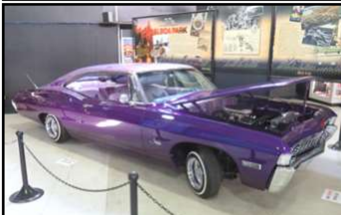
1968 Chevrolet Impala "lowrider"