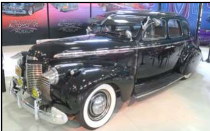
1940 Chevrolet Special Deluxe Sport Sedan "lowrider"