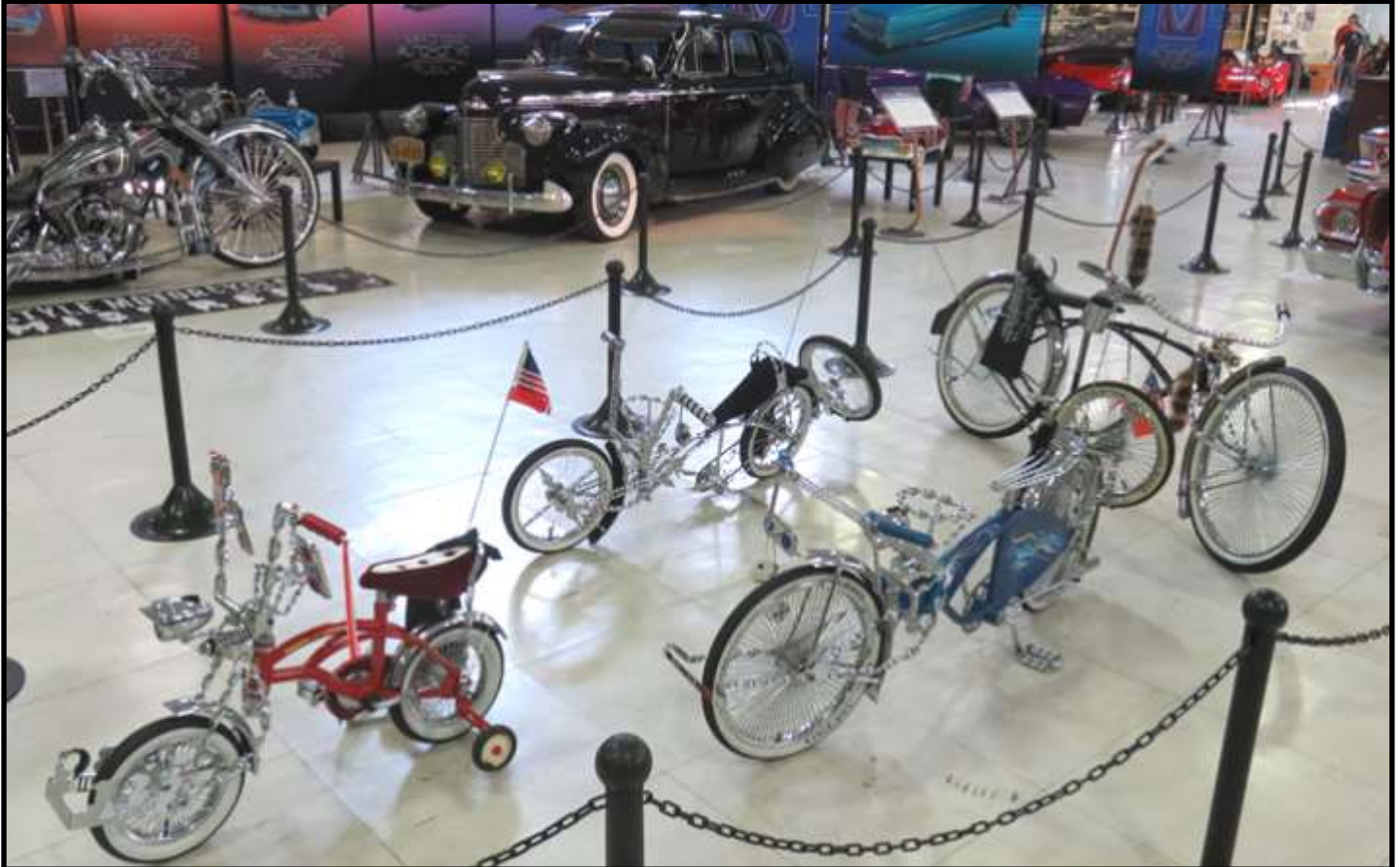
"Lowrider" bicycles: A) "Learning ABCs—Learning Time" built for a 3-year old girl; B) "Sweet Sixteen" built by a 16-yr old for his high school metal class project; C) "Sweet Dream" built by a 16-yr old; and D) "The Survivor"—a 1965 Schwinn Cruiser built by an 18-yr old