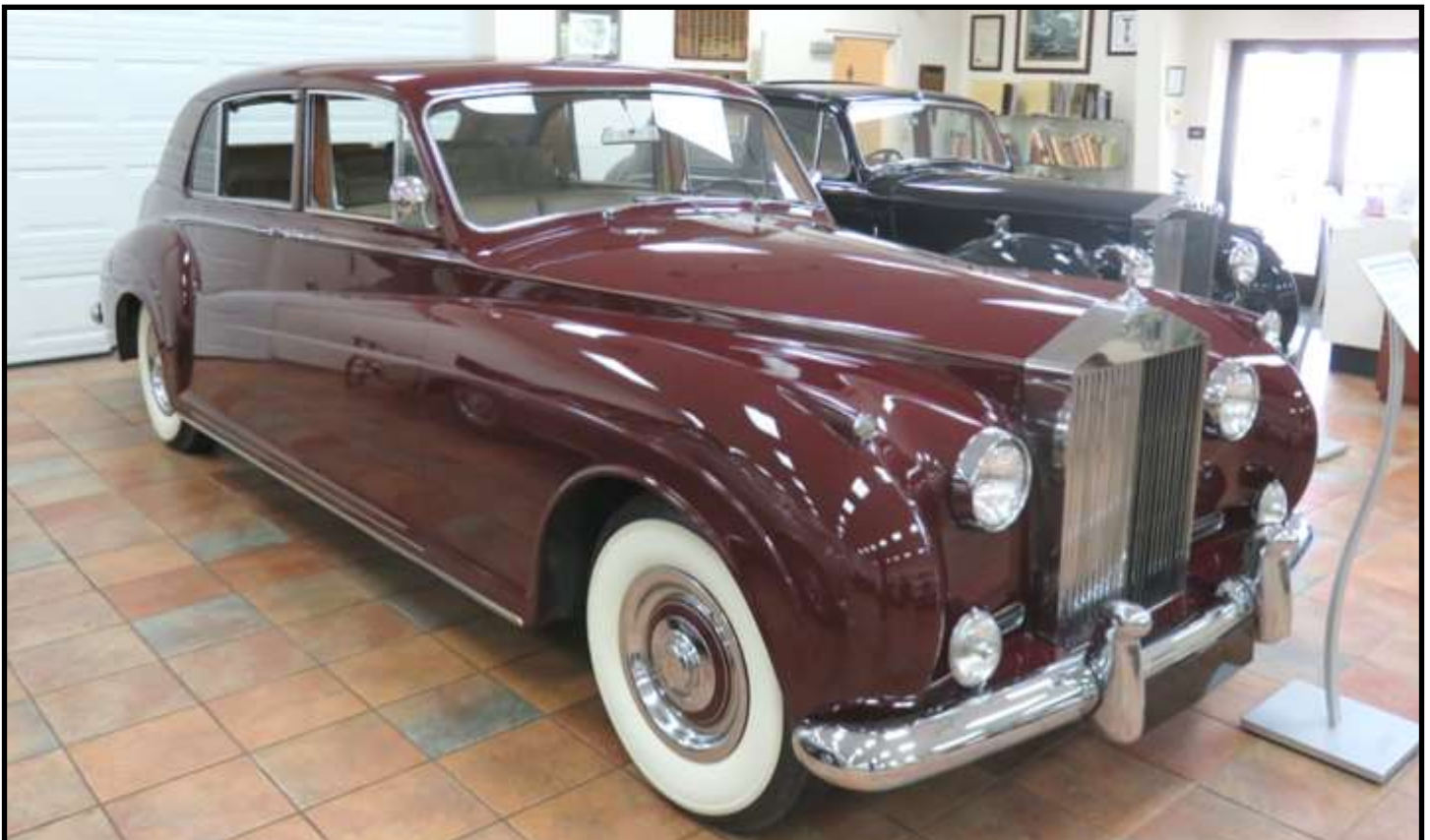
1961 Rolls-Royce Phantom V limousine at the Rolls-Royce & Bentley Museum in Mechanicsburg, PA