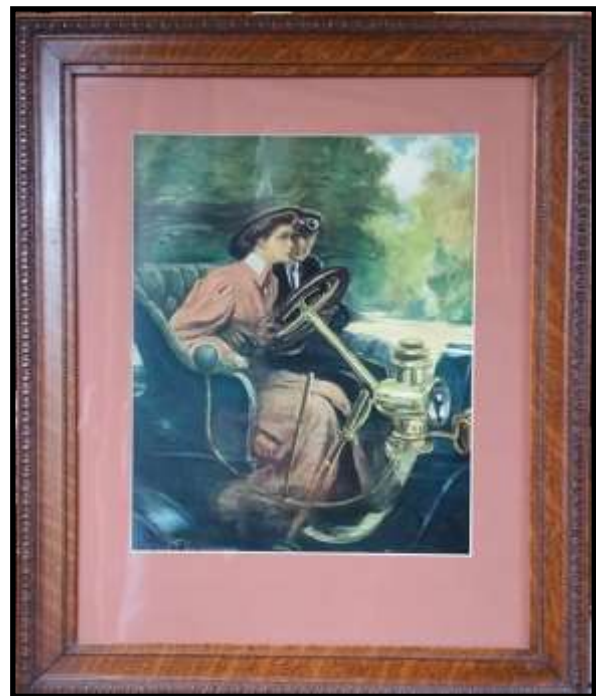
Early motoring print in an antique frame.

This wonderful antique shop find (thanks Susan!) came already framed in a beautifully refinished antique oak frame, with a suitable mat. It was sold as an "Antique frame" and not a motoring print. Nice find, and best of all, it was ready to hang.