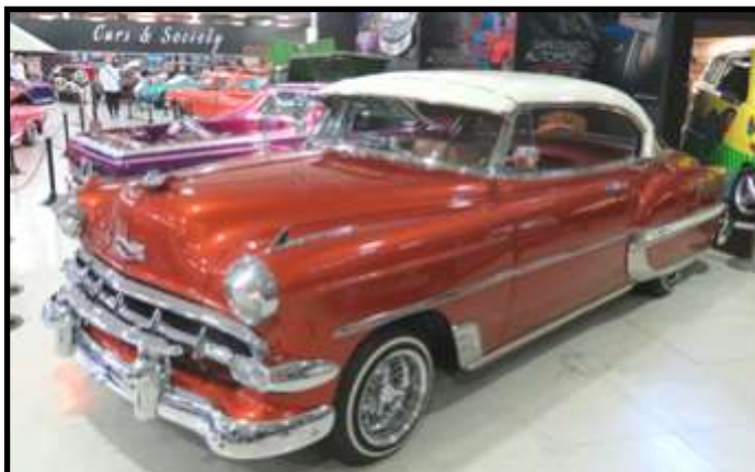
1954 Chevrolet Bel Air Sport Coupe "lowrider"