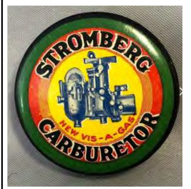
Stromberg Carburetor advertising tape measure, circa 1930s, value $40-$50.

One of the more commonly found tape measures is this one advertising Stromberg Carburetors on one side, and Stromberg shock absorbers on the other.