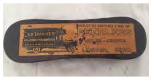
Clothes or shoe brush advertising "Peerless Transfer Company."

The top side of the brush was a perfect place for advertising. Brushes became a popular give-away or accessory for a lot of retailers. They were of course called "upholstery brushes" when distributed by automobile dealers. There are collectors out there who have hundreds of different advertising brushes But– few are automobile related. They can be difficult to find but are not what we'd consider a "mainstream" item for automobile enthusiasts. That means they are worth more to collectors of pure advertising than they are to automobilia enthusiasts. Here are a few examples: