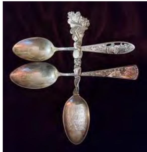
Assortment of antique silver spoons with early automobile related images on them.

promoting the cities they were made in – like Detroit!