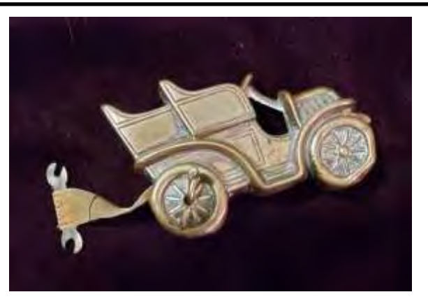
British-made automobile tape measure, circa 1900s. Value approximately $150-200.

The wonderful tiny tape measure shown next was made in England in the early 1900s. It is produced using two stamped pieces-each is one half (side) of the car. After the tape and winding mechanism is installed, the two halves are soldered together. These can be found in brass or silver and nickel plate finish. The tiny winding crank for the tape measure is sticking out from the rear wheel. Notice the end of the tape measure has a tiny wrench sewn into it. Be cautious though as there have been a few reproductions found recently. They are easily spotted as they lack the quality of an original and will contain a new tape measure.