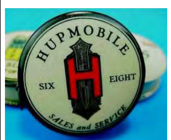
Hupmobile advertising tape measure, Circa late 1920s-1930s. Value $75-$100.