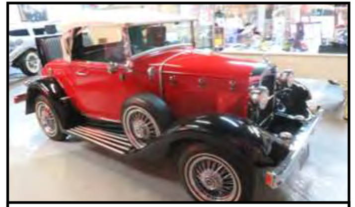
Ford Model A replica used to drive Liberace, wearing a red jumpsuit and white feather cape, onstage at the Las Vegas Hilton in the 1970s