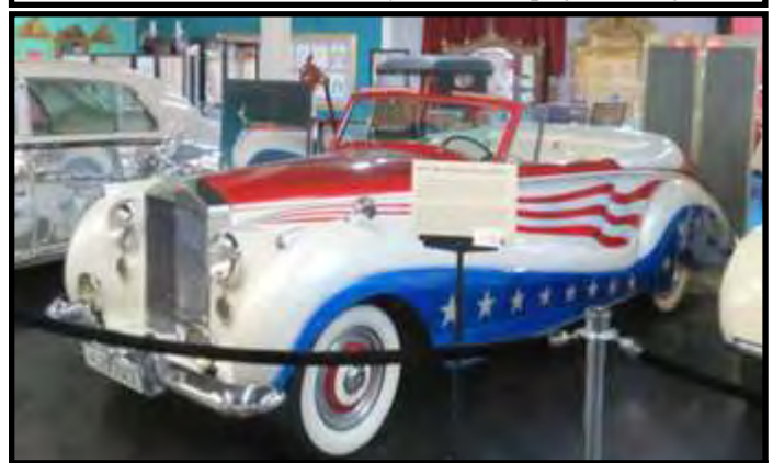
1976 "Bicentennial" Rolls-Royce convertible. (Actually, it is a customized 1954 Rolls-Royce Silver Dawn convertible.)