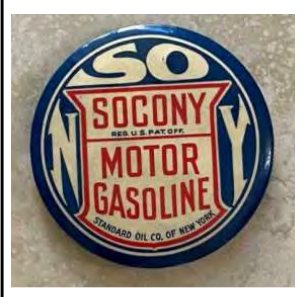
Socony Motor Gasoline brush. 1920s.

This Socony Motor Gasoline brush is more commonly found as a large sized pocket mirror.