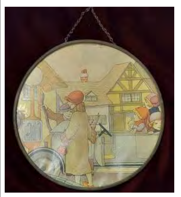
An early flue cover – gassing up an automobile. circa 1912-14.

The next flue cover is the only one like it I've ever seen. A pretty lady is seen having her automobile gassed up from an early pump. Wonder what the price was back then?