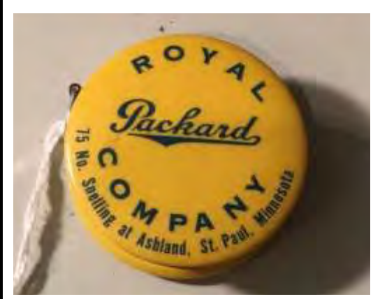
Small Packard dealer tape measure, circa 1940s-50s. Value, $75.

Advertising tape measures have been around a long time and are even being currently given-away by car and parts dealers. Older celluloid tape measures are very collectible and can be found advertising everything from carburetors to tires, and of course automobiles themselves.