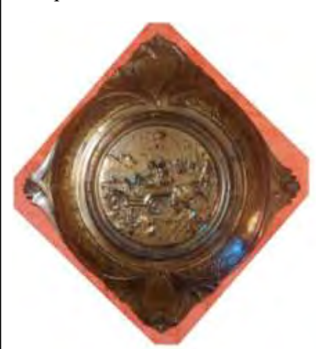
Die-stamped tin flue cover with an automobile theme. Circa 1908.

Another great example is made from stamped tin with a bronze finish. It is very unusual, but several Clothing or Shoe Brushes examples are known.