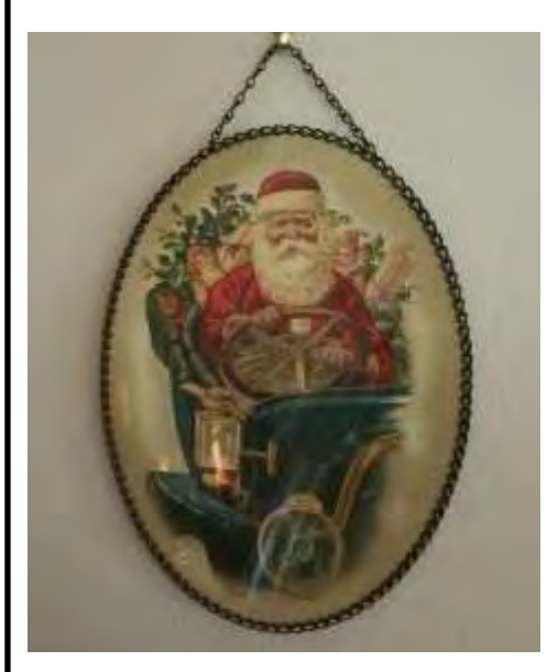
Santa drives an automobile in this Christmas themed flue cover.

Santa drives an antique car in this early oval shaped flue cover. The same image appears on a postcard. Be cautious as reproductions of this have been made. Originals will have a thin glass cover while the reproductions have plexiglass protecting the image. Of course a close look will reveal the tell-tale tiny dots arranged neatly in rows. That is typical of modern lithography. Originals will also have those dots as well but they will be random rather than neatly organized. It may take a magnifying glass to see them though.