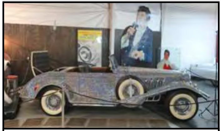
The "Rhinestone Roadster"—its rhinestones match Liberace's piano and costume in his 1986 Radio City Music Hall performance finales