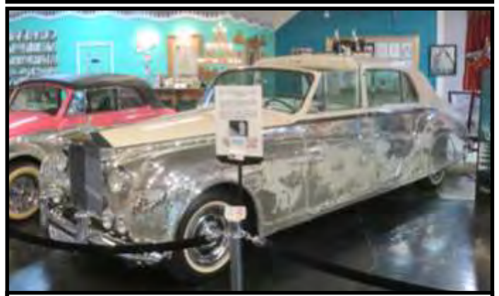
Customized 1961 Rolls-Royce Phantom V Sedanca de Ville town car in which Liberace rode onto the stage hundreds of times in Las Vegas