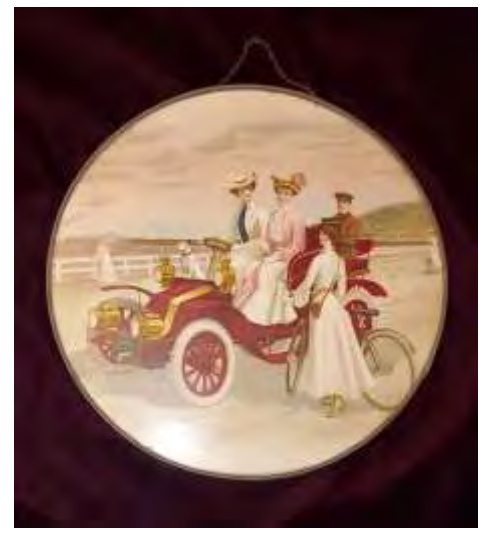
Early 1900s automobile flue cover.

Those with automobiles on them however are actually very rare. Not that the automobile wasn't popular they were just not as "decorative" as other subject matter.