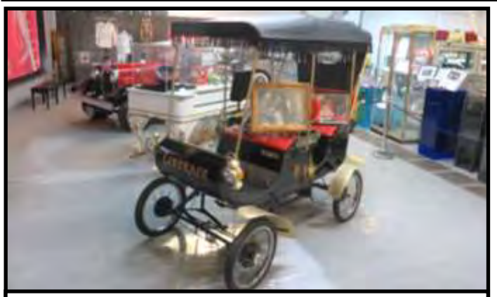
3/4-scale replica 1901 Oldsmobile curved-dash surrey purchased by Liberace for his Liberace Museum originally in Paradise, NV