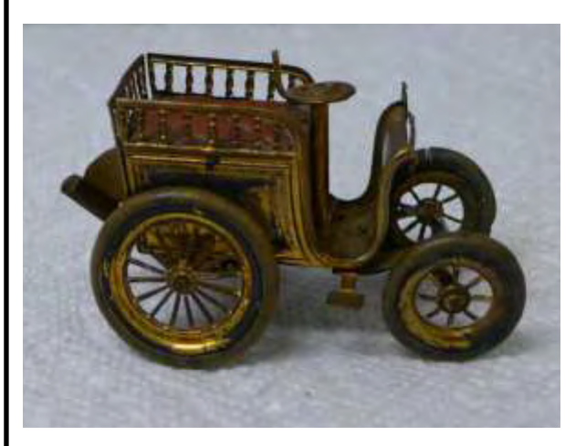
figural tape measure automobile – early 1900s. Value-$300-$400.

This example of a very early automobile also has a fabric or leather covered seat that could be used as a pin cushion. The tape measure actually has a spring-loaded mechanism inside that recoils the tape.