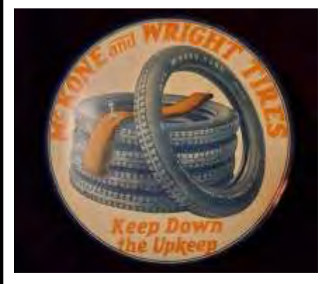
Early tire advertising brush, circa 1915.

Brushes come in all shapes and sizes and these round shaped brushes have fragile celluloid advertising on top, making them difficult to find in good condition. These round brushes are usually 3 1/4 - 3 1/2 inches in diameter and most were made by the Parisian Novelty Company in Chicago. I have seen others made by Bastian Bros. in Rochester. NY also. The manufacturers name should be printed along the edge. They can be found advertising automobiles, tires, gasoline and motor oil most frequently. The tire advertising brush seen in the next photograph is very rare.