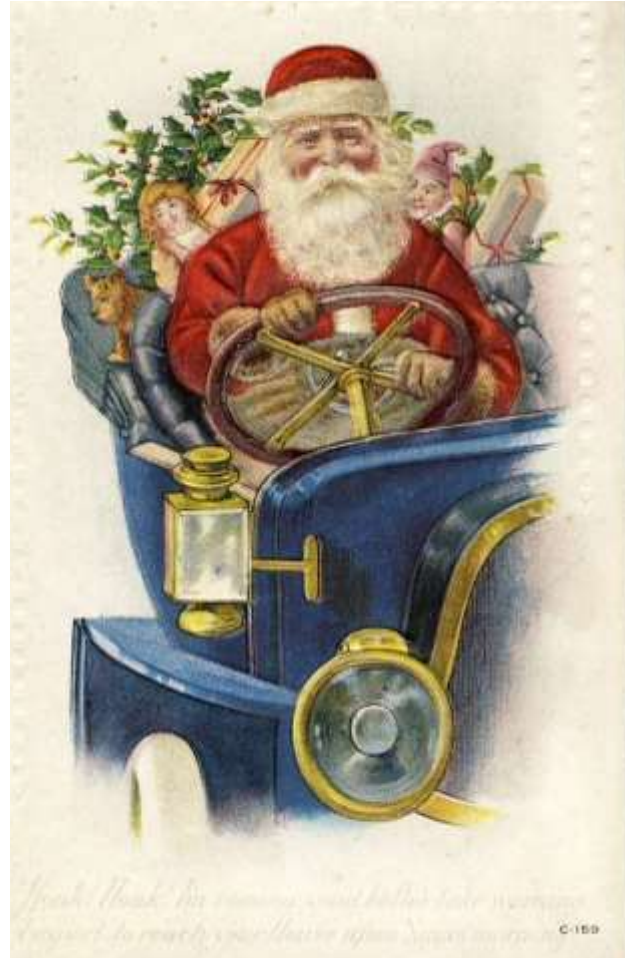
Santa postcard, 1910.

Here is the same image used on a postcard that was actually mailed in 1910.