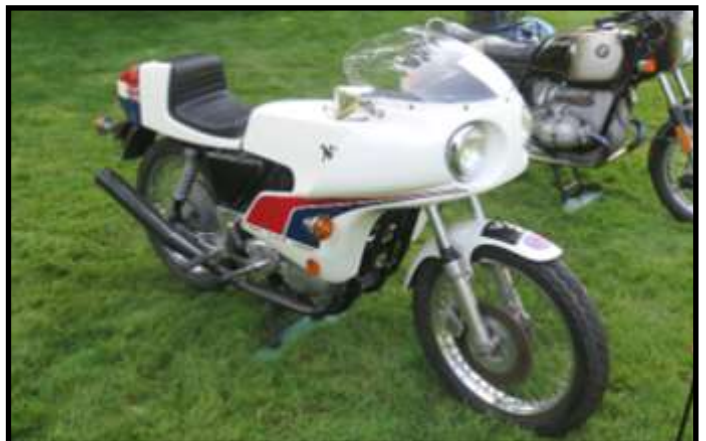
1974 Norton John Player Norton (JPN) 850