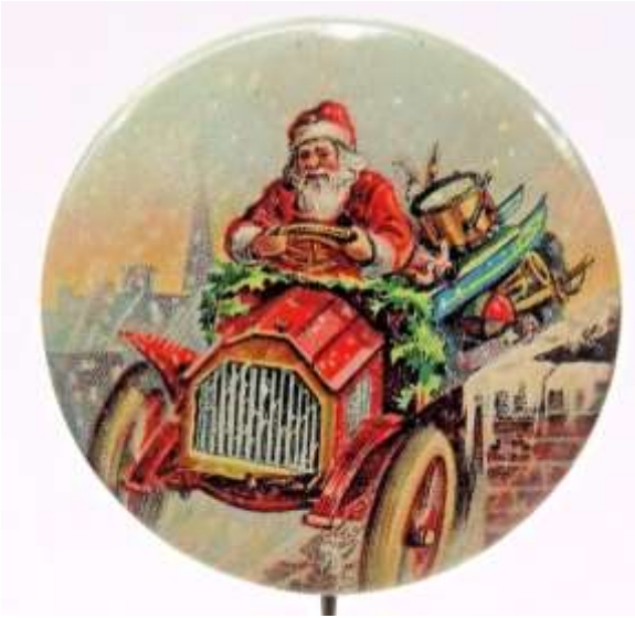
Another example of a department store advertising pin.

The scene seen on the plate below also appears on other ceramic items. Most often it is seen in a child-sized tea set. It was made in Germany around 1910 and was widely exported to England and America. Made of delicate porcelain few survived.