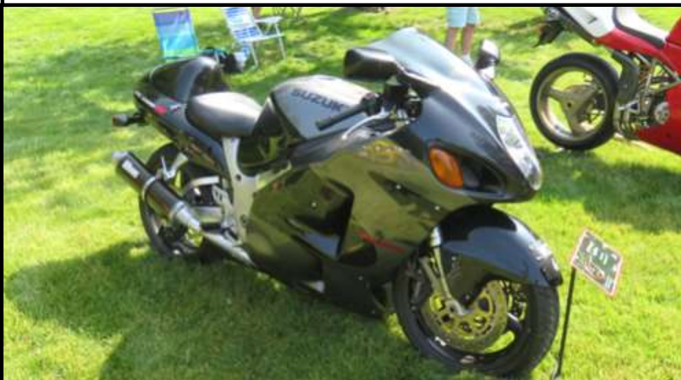
1999 Suzuki Hayabusa motorcycle at the 2023 EyesOn Design Car Show at the Edsel & Eleanor Ford House in Grosse Pointe Shores, MI. See more motorcycles in the article on Pages 4-9.