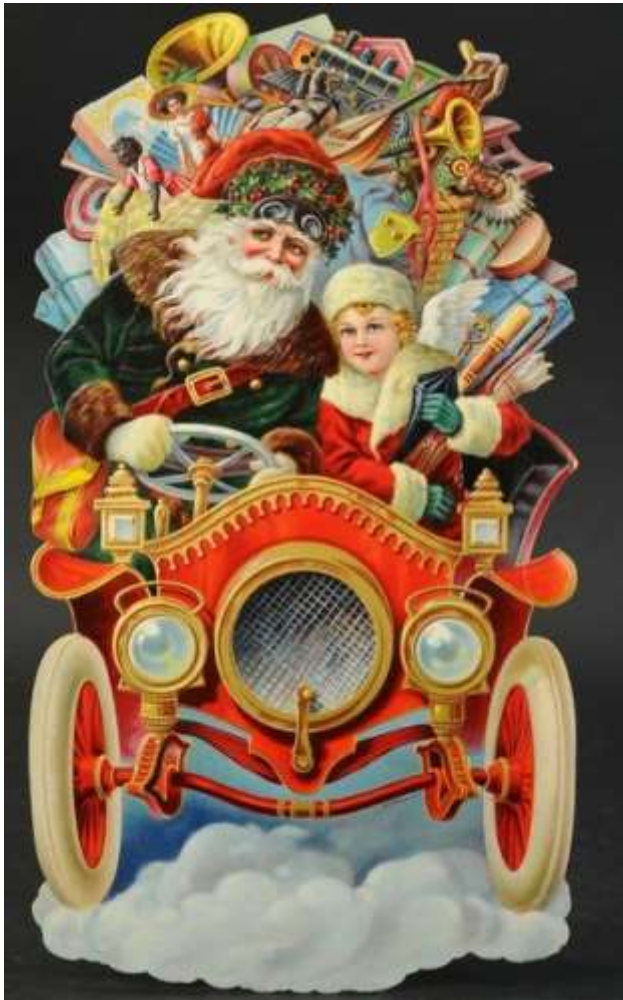
Santa driving his circa 1904, printed in Germany. Automobile