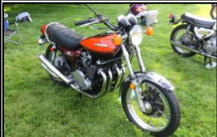
1973 Kawasaki Z1 900