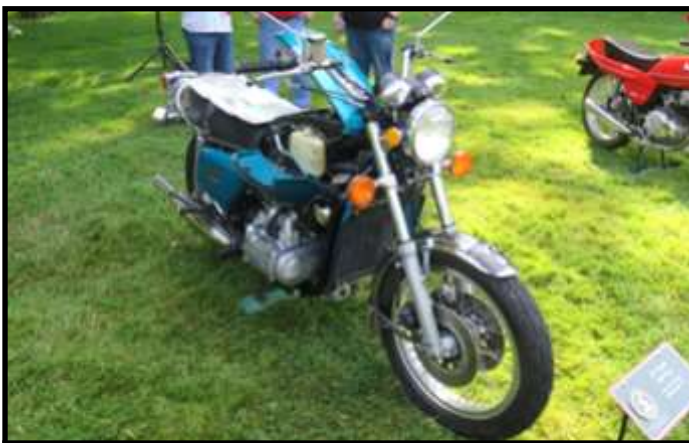
1975 Honda Gold Wing (liquid-cooled 999cc engine)