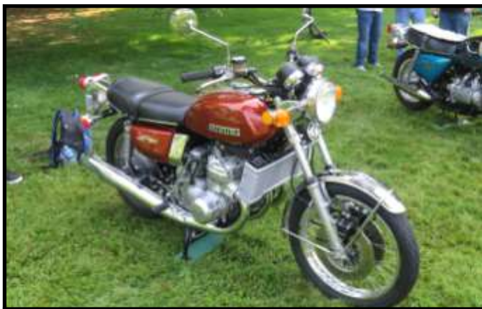
1975 Suzuki GT750