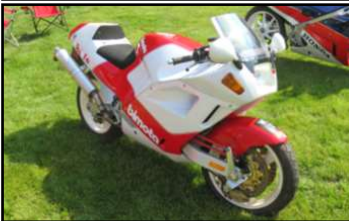
1992 Bimota Tesi 1D "superbike"—only 20 were made