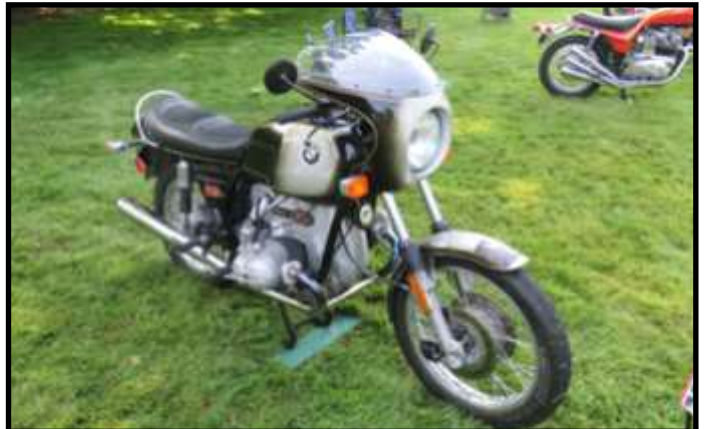
1974 BMW R90S (900cc)