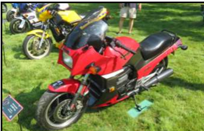
1984 Kawasaki GPz900R Ninja