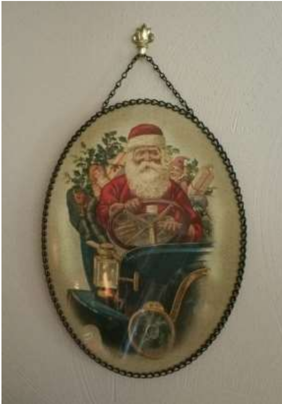
Chimney flue cover. Circa 1910.

Some images appear on other items in addition to postcards. This great chimney flue cover shows Santa driving an automobile. Originals are very hard to find but this particular item was reproduced several years ago and can still be found inexpensively.