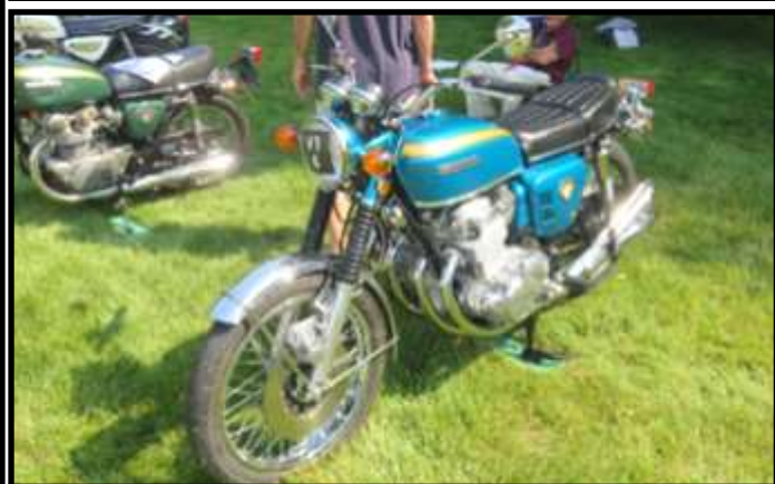
1969 Honda CB750