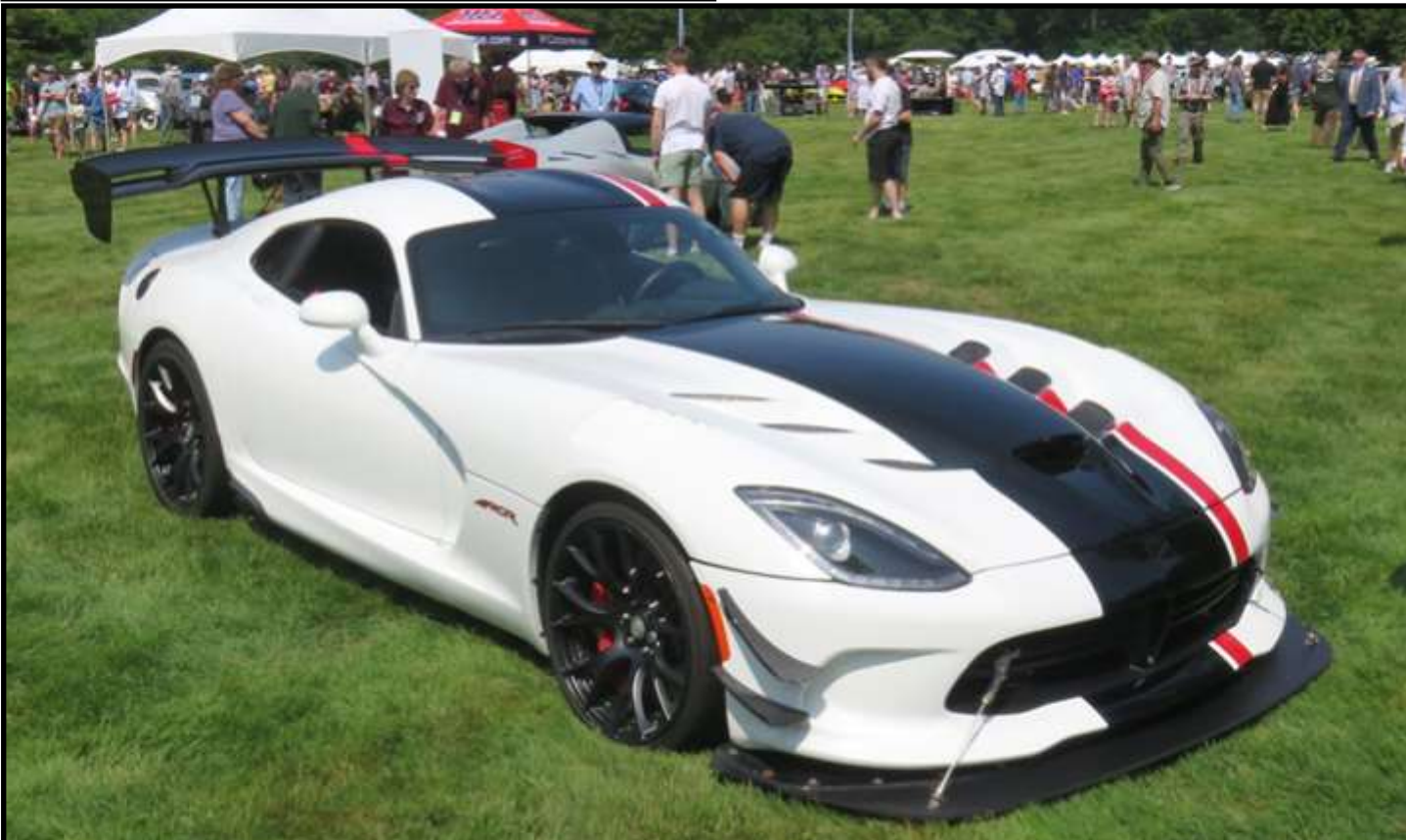
2016 Dodge Viper ACR at the 2023 EyesOn Design Car Show held at the Edsel & Eleanor Ford House in Grosse Pointe Shores, MI

1919 Monticello Avenue Norfolk, Virginia 23517