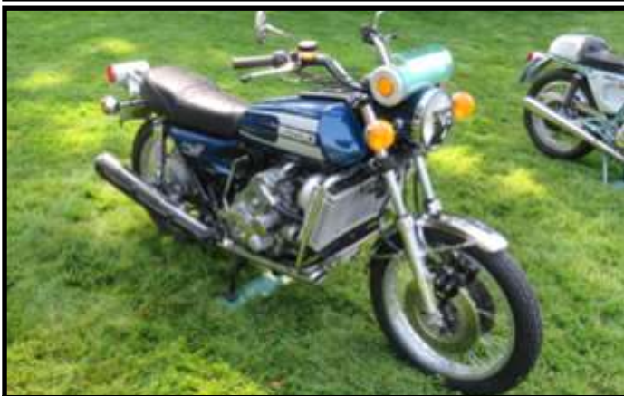
1975 Suzuki RE5 (with single-rotor 497cc Wankel engine)