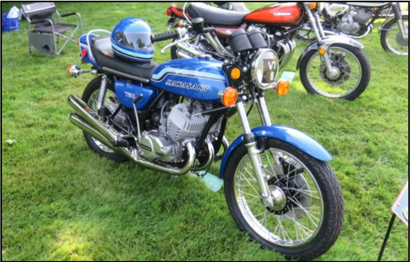
1972 Kawasaki H2 Mach IV (750cc)