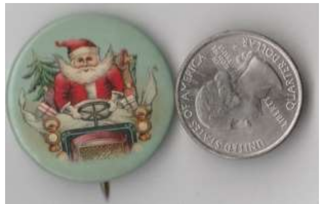
Santa in his automobile appear on this celluloid pin - a department store give-away, circa 1910-15. Quarter is for size comparison.

All kinds of items in the 1900s and teens were produced showing a "modern" Santa driving a new automobile.