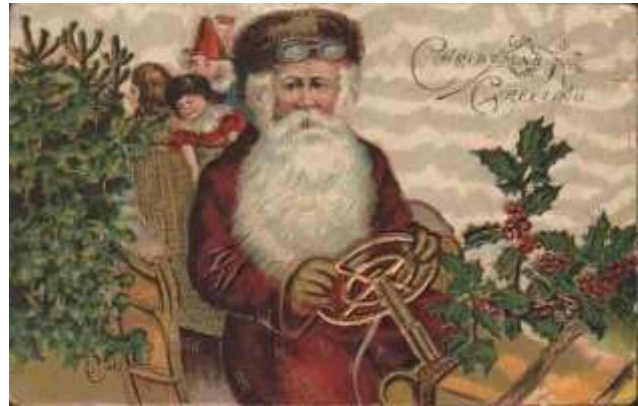
Another card in the set of six showing Santa behind the wheel.