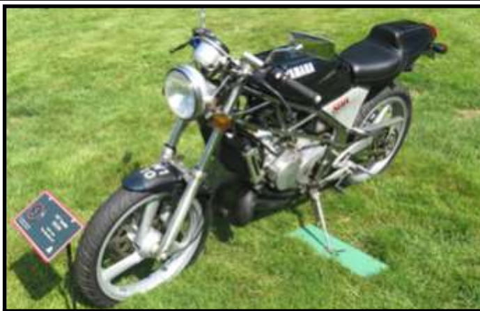
1987 Yamaha SDR200