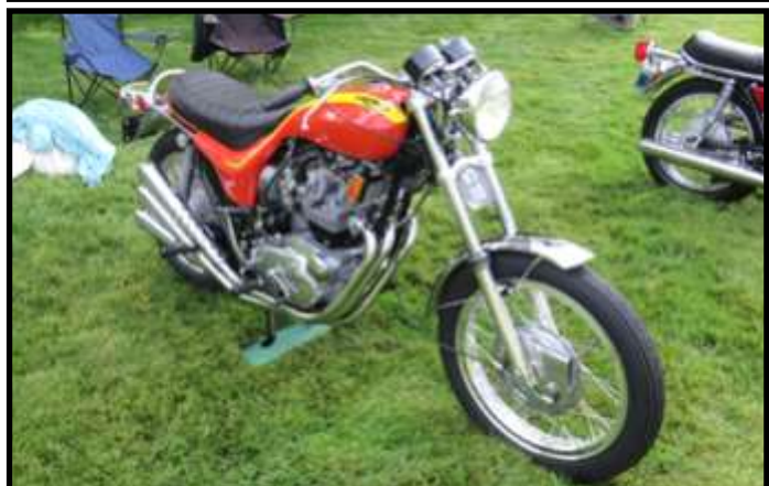
1973 Triumph X75 Hurricane (740cc)