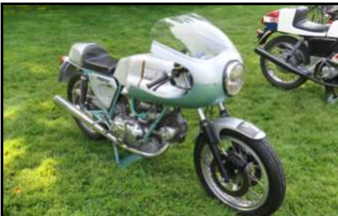
1974 Ducati 750 Super Sport