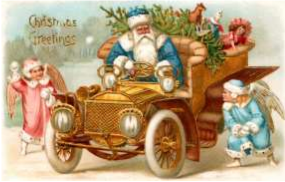
Santa gets help with a flat tire.

Some images appear on other items in addition to postcards. This great chimney flue cover shows Santa driving an automobile. Originals are very hard to find but this particular item was reproduced several years ago and can still be found inexpensively.