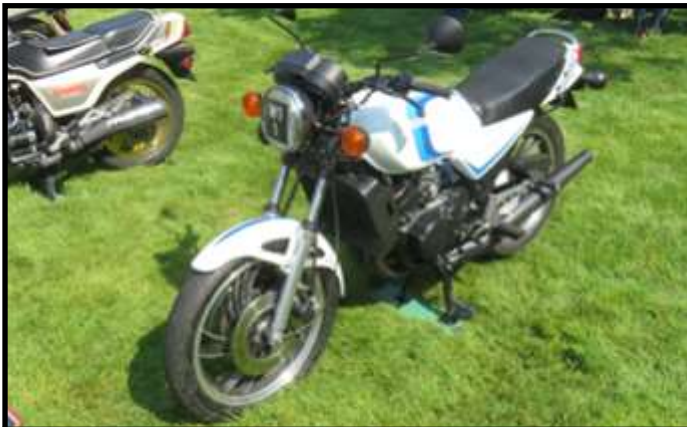
1981 Yamaha RD350LC