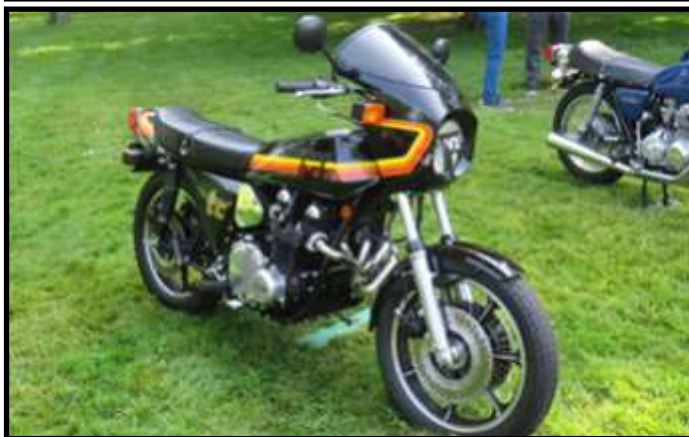
1979 Kawasaki Z1RTC (turbo-charged 1,106cc engine)