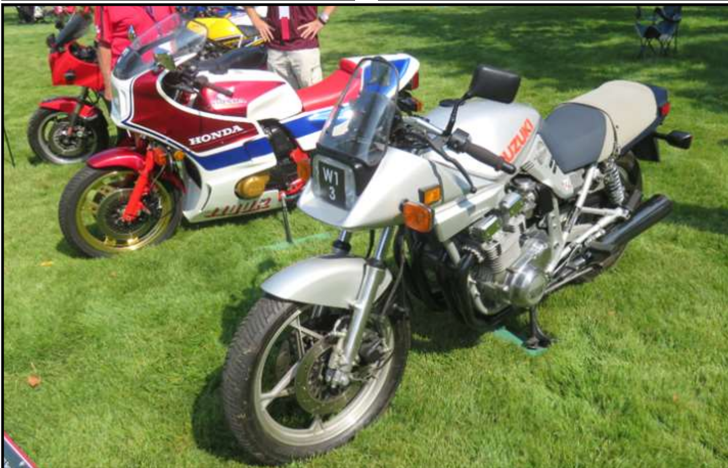
(L-R) 1983 Honda CB1100RD and 1982 Suzuki Katana 1000