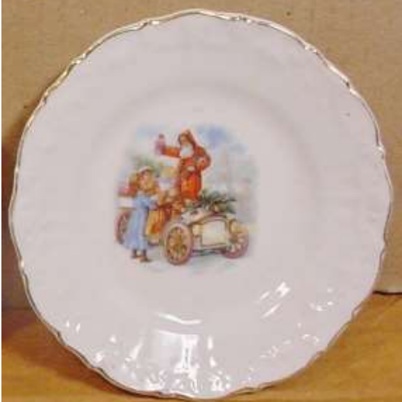
This plate is from a complete child's tea set showing Santa and an automobile. It was produced in Germany circa 1910.

The scene seen on the plate below also appears on other ceramic items. Most often it is seen in a child-sized tea set. It was made in Germany around 1910 and was widely exported to England and America. Made of delicate porcelain few survived.