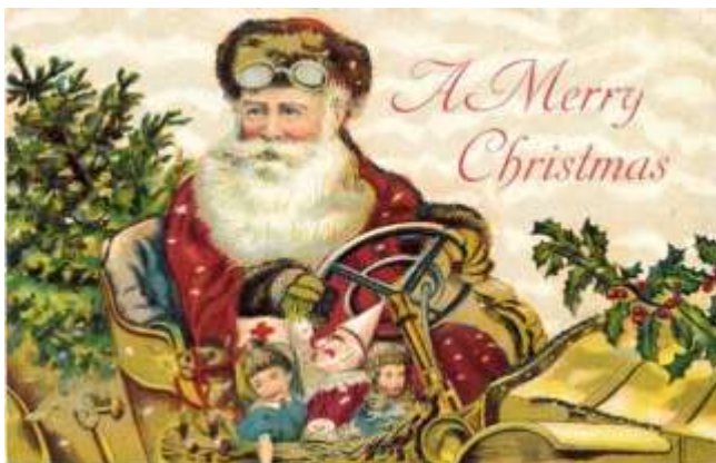
This card is part of a six-card series showing Santa in different poses and different colored robes. They were produced in Germany for the American market. 1908.