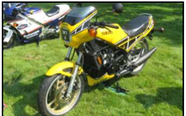
1985 Yamaha RZ350