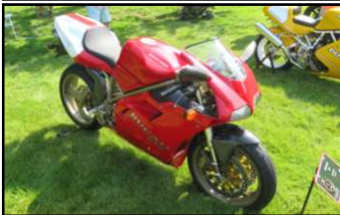
1994 Ducati 916