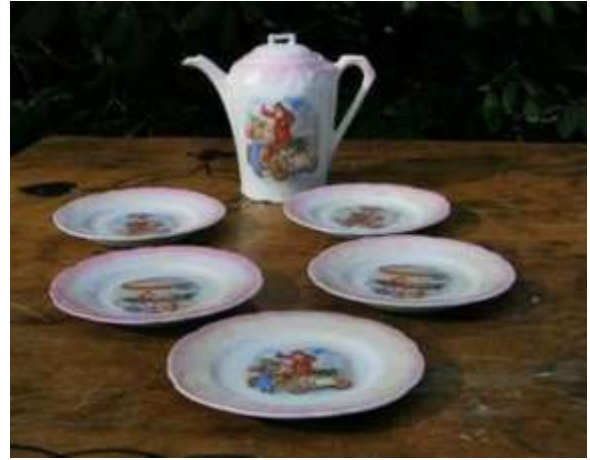
Additional pieces from the child's tea set, This set also contained several items decorated with air-ships.

Other decorator items such as this wicker figurine came out only at Christmas time and were placed around the Christmas tree, much like what was done with train sets in a later time. These delicate objects are highly sought after today as survival was not good for them.