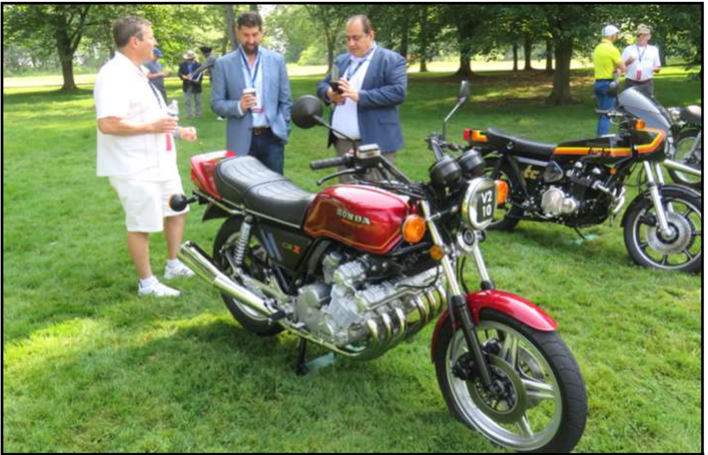
1979 Honda CBX (with 1,047cc inline 6-cylinder engine)