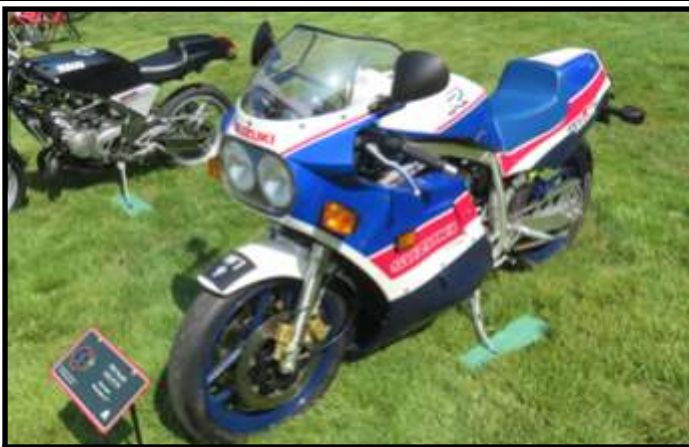
1986 Suzuki GSXR750