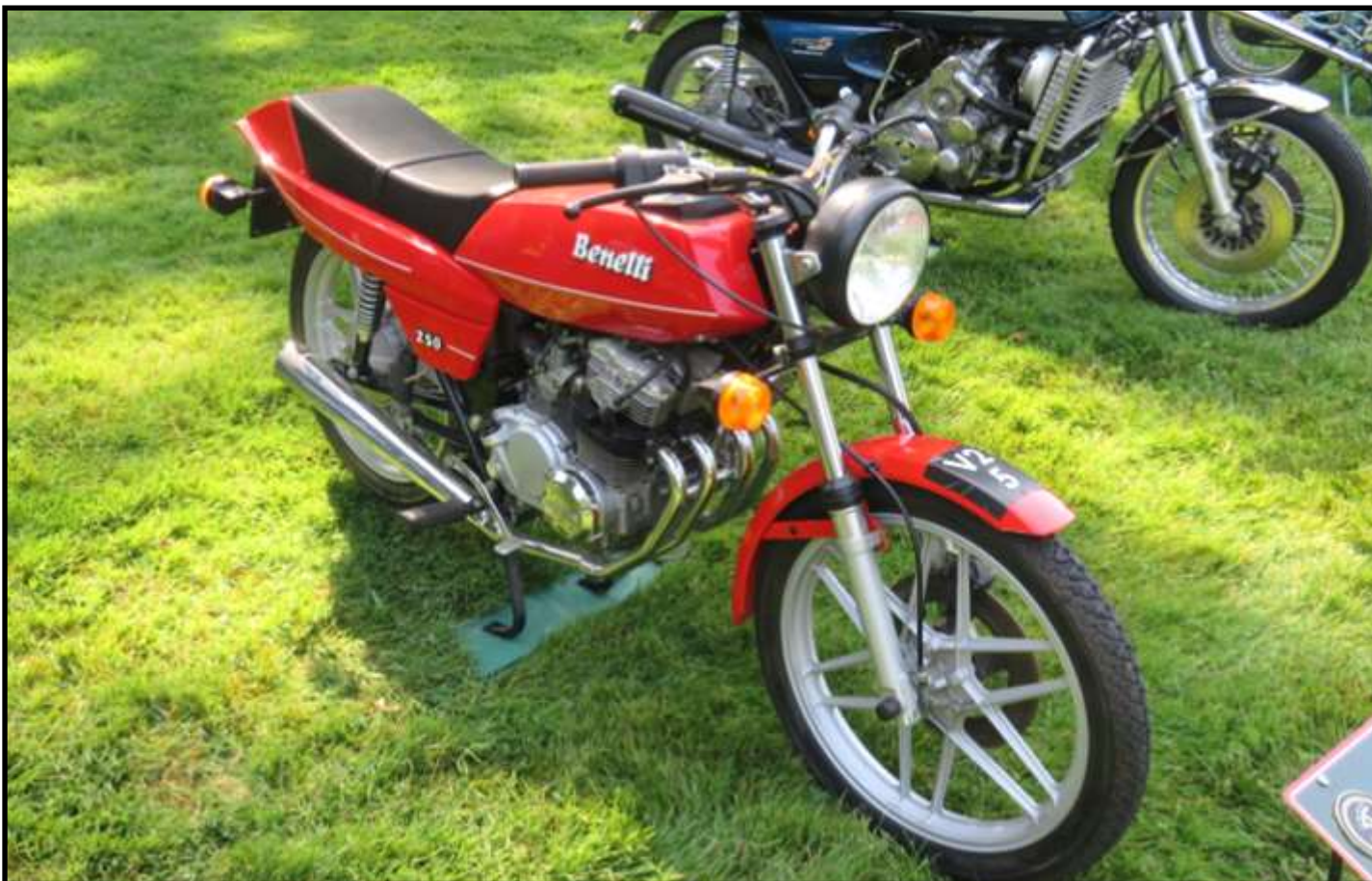
1975 Benelli 250-4