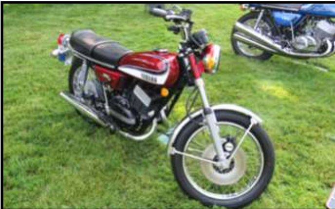
1973 Yamaha RD350