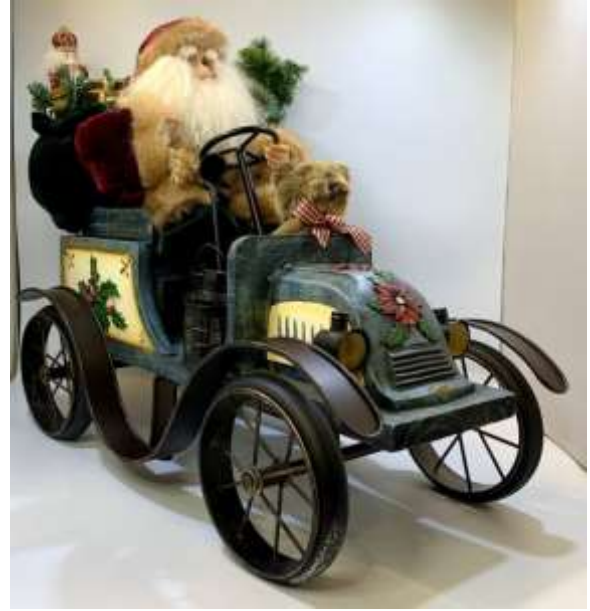
Large Santa in his automobile sold by Kirkland.