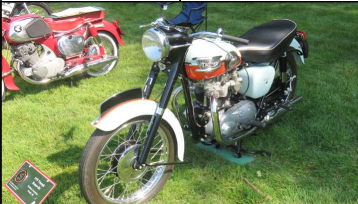
1958 Triumph Bonneville