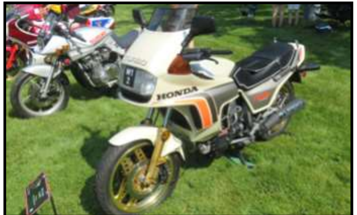
1983 Honda CX500T (with 497cc engine and shaft-drive)