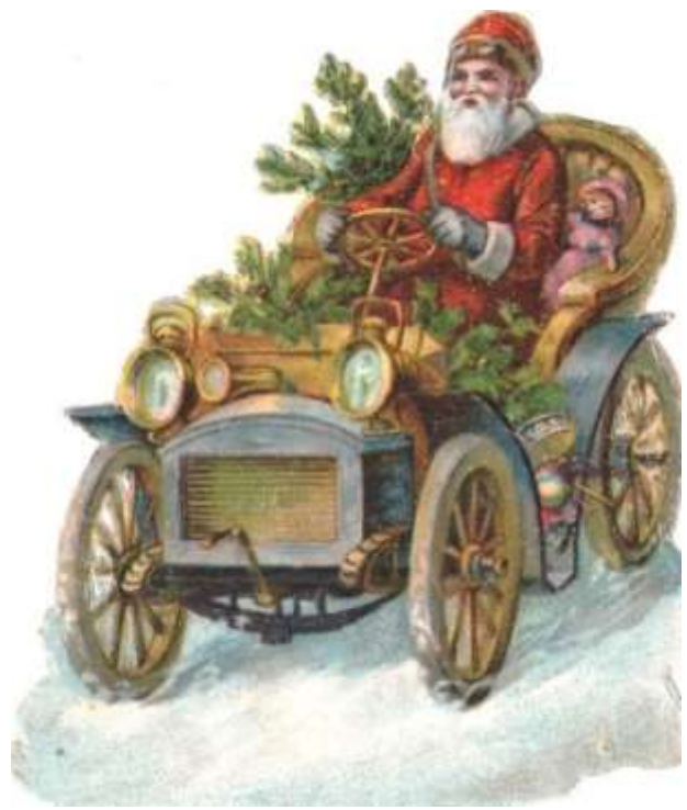
A Victorian scrap from my collection depicting Santa driving an automobile circa 1905.

Greeting cards are where you'll find the most commonly seen images of Santa driving an automobile. Here are a few examples from my collection.