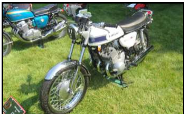
1969 Kawasaki H1 Mach III (500cc)