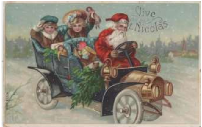
A great Santa Christmas card, German, circa 1906