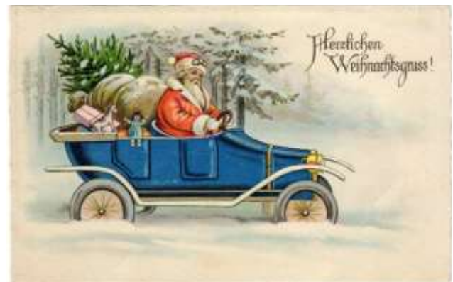
A German Christmas themed postcard mailed in 1913.

The most amazing postcards were produced by German and English companies. Many were highly embossed and elided – examples of lithography at its' best during what is known as the “golden age” of the postcard.