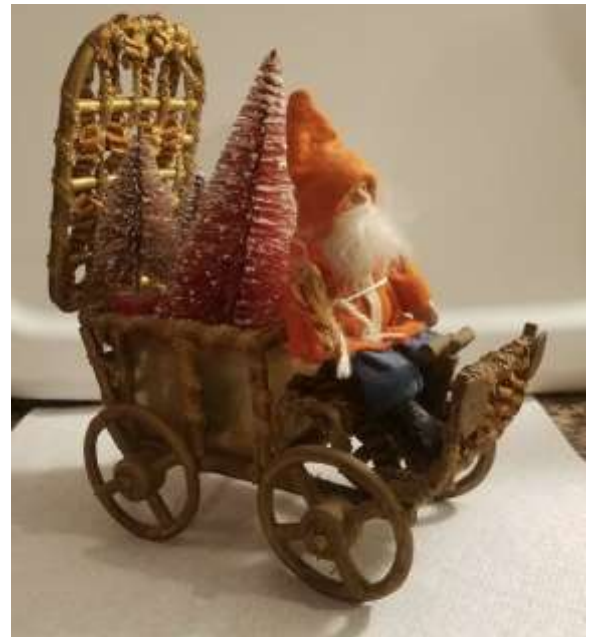
Santa driving a wicker automobile. Circa 1908-10.

Other decorator items such as this wicker figurine came out only at Christmas time and were placed around the Christmas tree, much like what was done with train sets in a later time. These delicate objects are highly sought after today as survival was not good for them.