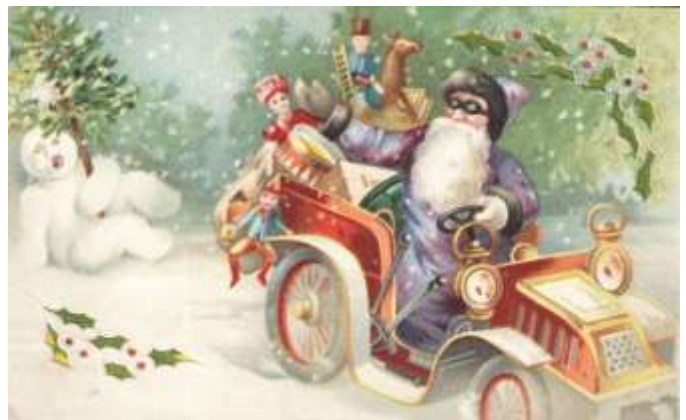
Santa has run over a snowman while making his deliveries! English, 1904.

Postcards can be fairly easy to date based on postal cancellations. The wonderful card shown next was mailed in 1908 and shows Santa getting a little help with a flat tire.