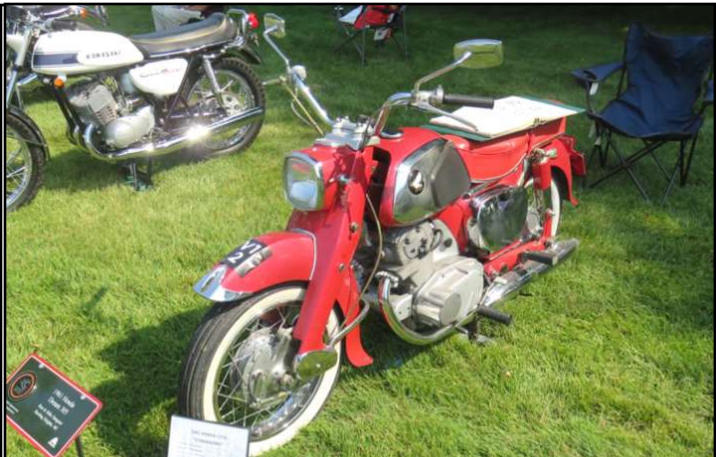
1961 Honda Dream 305