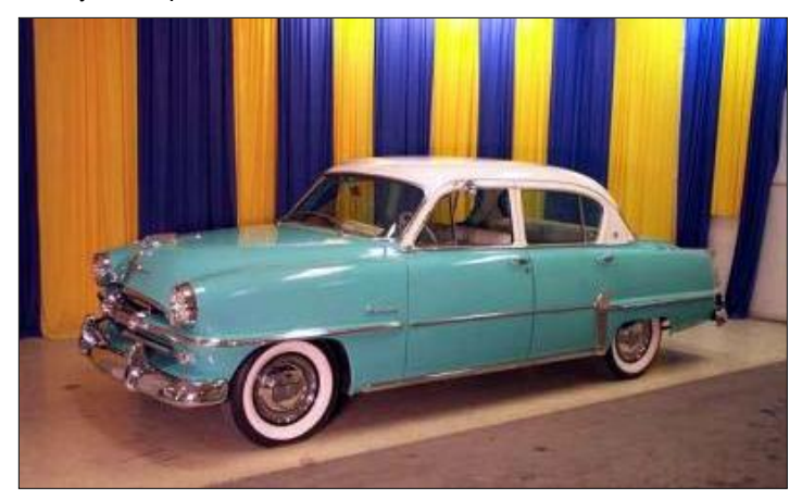
1954 Plymouth, part of the 1954 sales disaster

beautiful and functional. He was given free reign to design whatever he wanted. His many concept cars all had what would become Exner trademark elements; classical looking radiator type grills, big cut outs around all four wheels, spare tire holders molded in the rear body and wild head and tail lights. Later, he added a design feature that would become the symbol for 1950's automotive design; aircraft like tailfins. He thought that Italian design was most in line with his philosophy. He traveled to Italy many times to look at trends and hired Ghia studio to build his many concept cars.