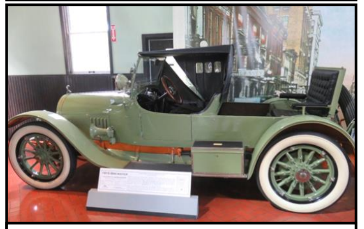
1915 Brewster Country Club Roadster

(Front L-R) 1910 Lozier Briarcliff & 1905 Packard Model N