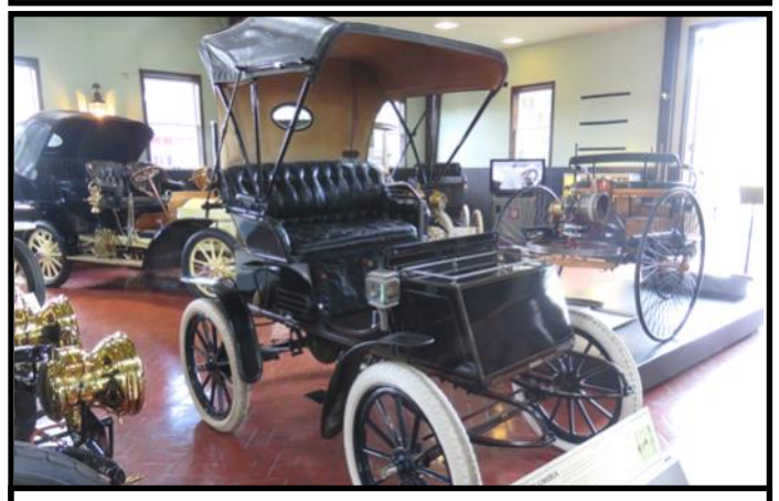
1903 Columbia Electric Runabout