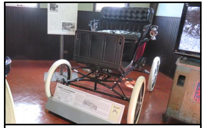
1899 Locomobile Steam Runabout