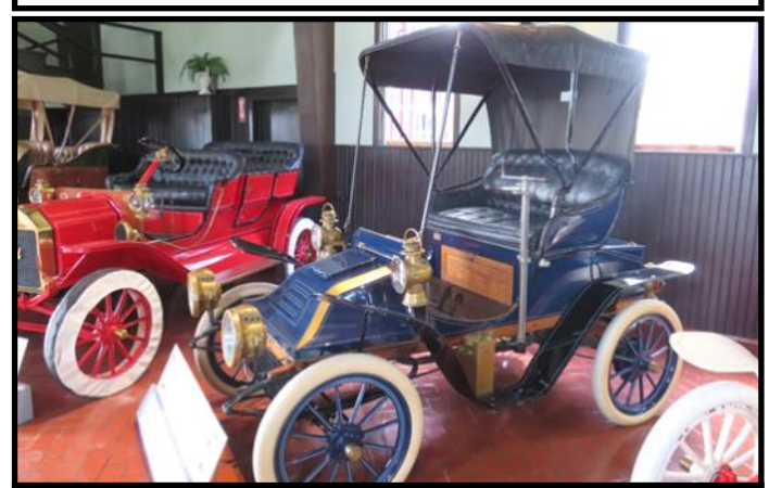
1904 Autocar Runabout