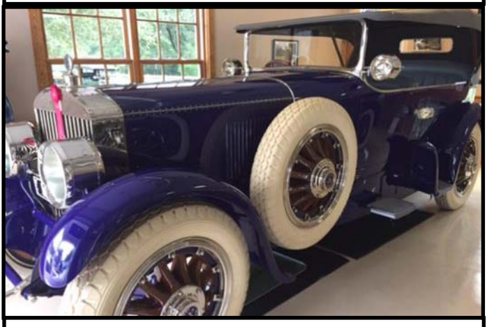
1919 Pierce-Arrow 66 originally owned by Fatty Arbuckle