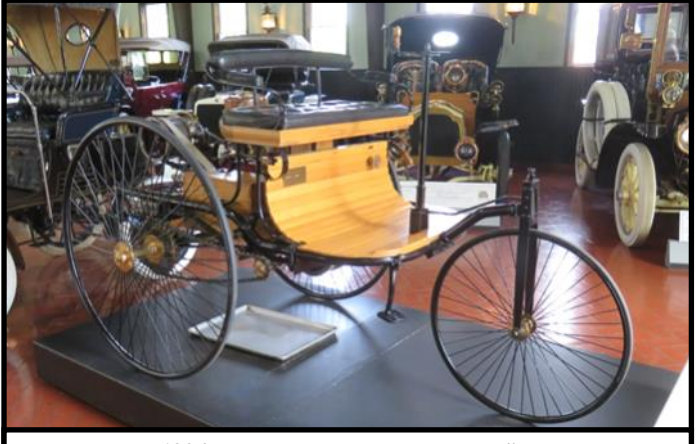
1886 Benz Patent-Motorwagen replica