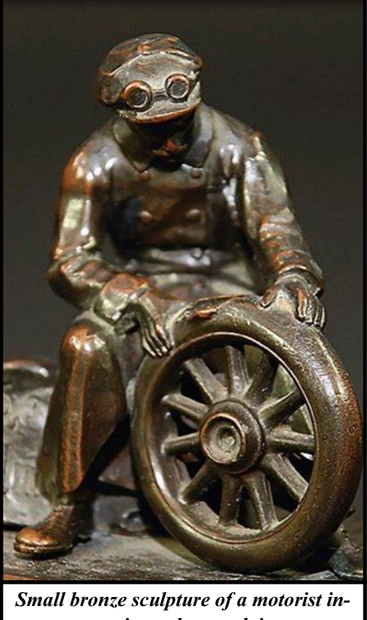
specting a damaged tire.

This is a delightful motoring figurine depicting a typical motoring hazard in the early 1900s. Possibly French, circa 1908. This example was found at Hershey several years ago.