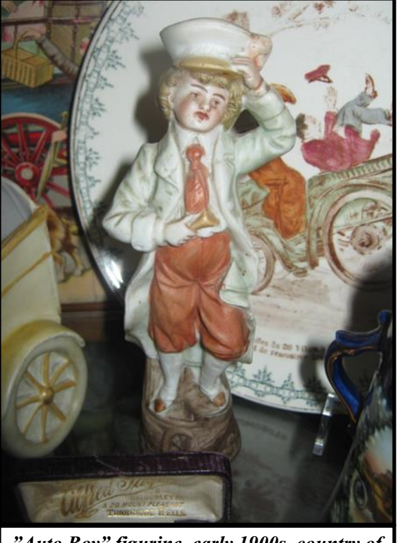
"Auto Boy" figurine, early 1900s, country of origin unknown.

This is a well-known automobile figurine that serves as a candy jar. Its large size might indicate it was used on the counter in a store. These are of French manufacture and come in a variety of colors including plain frosted glass with gold highlights. The gold was hand applied so variations exist among known examples. This pretty turquoise colored example was sold recently at a major European auction. The roof comes off and forms the lid. There are often chips