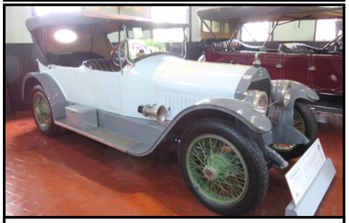
1919 Stutz Bulldog