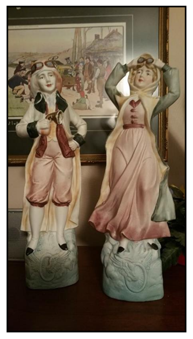
Another early motorist figurine is the delightful early motorist holding a small brass horn with "Auto Boy." Inscribed on its' base. It's been in my collection a long time and is probably very lonely for the companion piece that I'm sure must also exist – "Auto Girl." If you see one please let me know.

Below is a very rare pair of motoring figurines. This type of figurine often consisted of a "pair" consisting of man and woman, dressed appropriately in motoring attire, sometimes holding a horn, brass lamp, or travel bag. Note the winged wheel on the base. These were made from delicate bisque porcelain and are very fragile. Finding a pair in such great condition as these is very difficult.