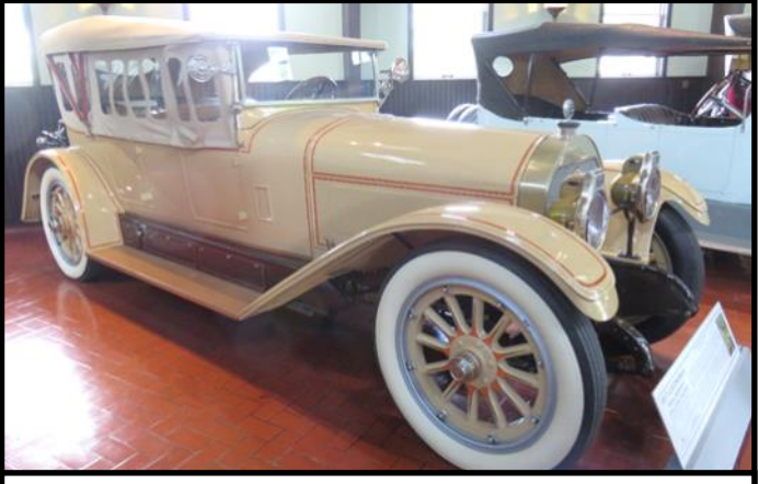
1917 Locomobile Model 48 Sportif Dual-Cowl Phaeton