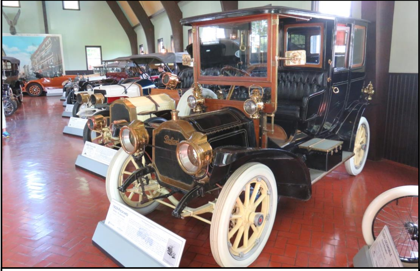
(Front L-R) 1910 Lozier Briarcliff & 1905 Packard Model N Touring Car