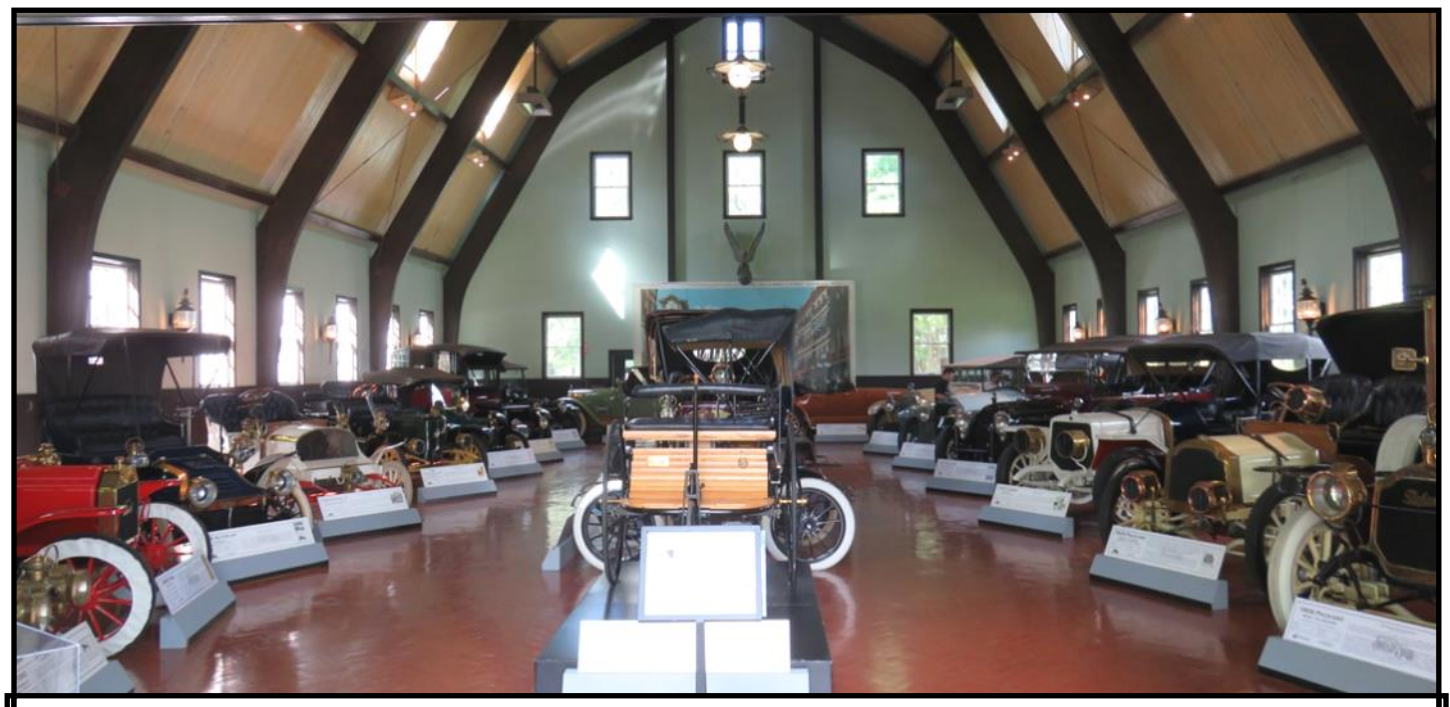
The interior of the Carriage House-the first display building built to display Donald Gilmore's collection at the Gilmore Car Museum

Don't forget to put the Gilmore Car Museum on your bucket list. You will not regret it!