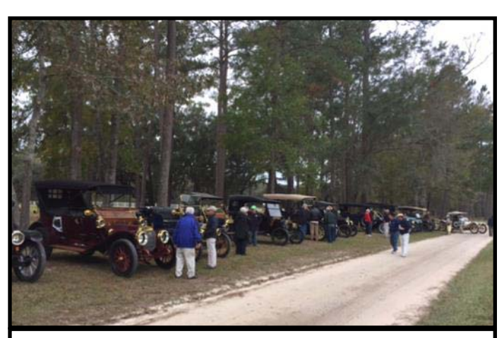
The 2016 AACA Reliability Tour stops at Gregorie Neck Plantation