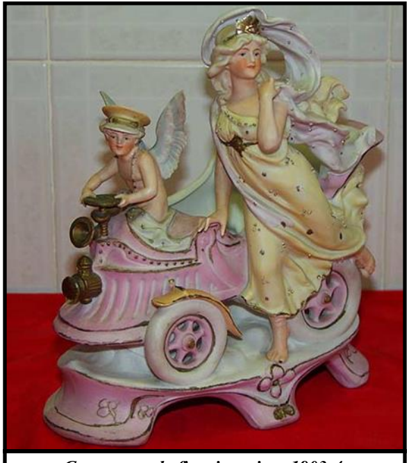
German made figurine, circa 1903-4.

This is a well-known automobile figurine that serves as a candy jar. Its large size might indicate it was used on the counter in a store. These are of French manufacture and come in a variety of colors including plain frosted glass with gold highlights. The gold was hand applied so variations exist among known examples. This pretty turquoise colored example was sold recently at a major European auction. The roof comes off and forms the lid. There are often chips