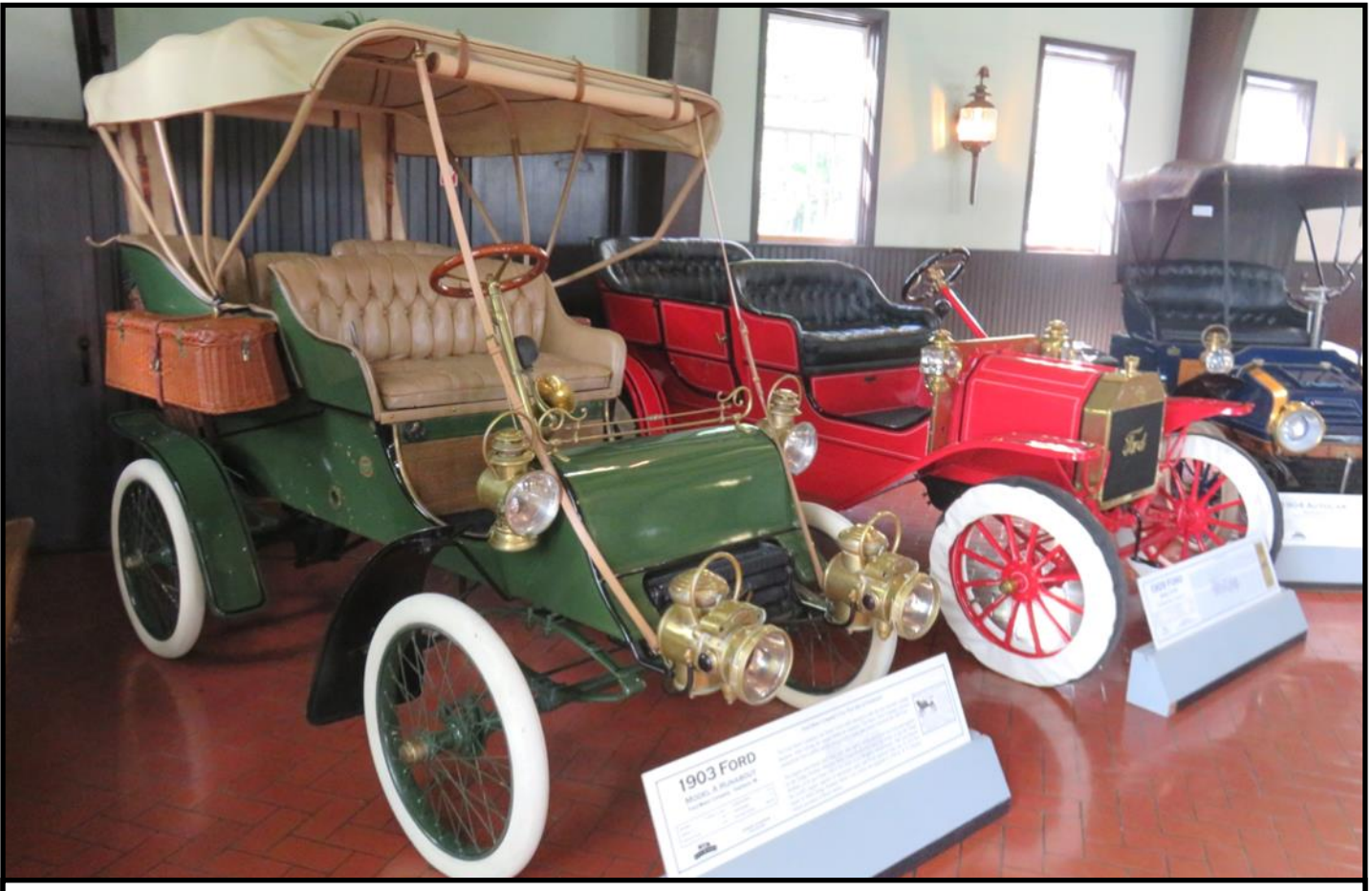
(L-R) 1903 Ford Model A Runabout and 1909 Ford Model T (#131 produced)