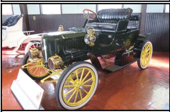
1908 Stanley Steamer Runabout