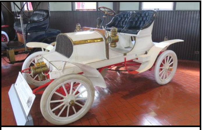
1905 Franklin Gentleman's Runabout