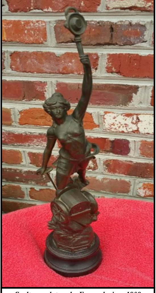
Spelter sculpture by Ferrand, circa 1908

The first figurine I ever purchased for my collection. It came from an antique shop in Scotland. I had asked previously about automobile related items and a few days later, this appeared in the shop window.