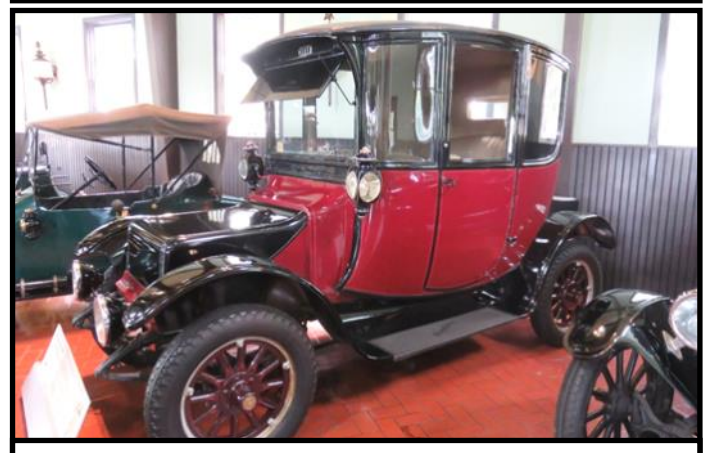
1915 Rauch & Lang Electric Coach