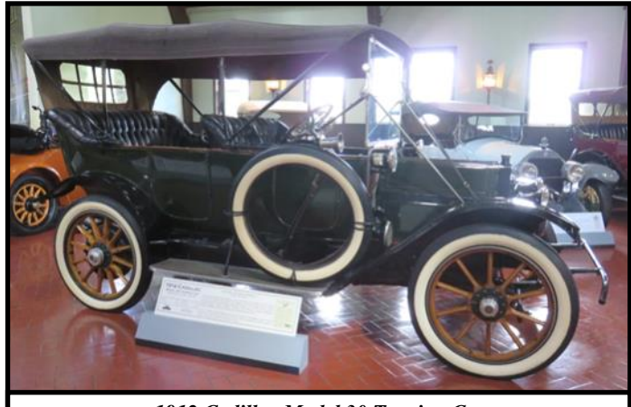
1912 Cadillac Model 30 Touring Car