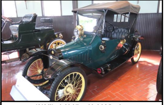
1915 Woods Mobilette Model 5 Roadster