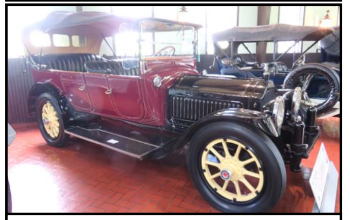
1917 Packard Twin Six Touring Car