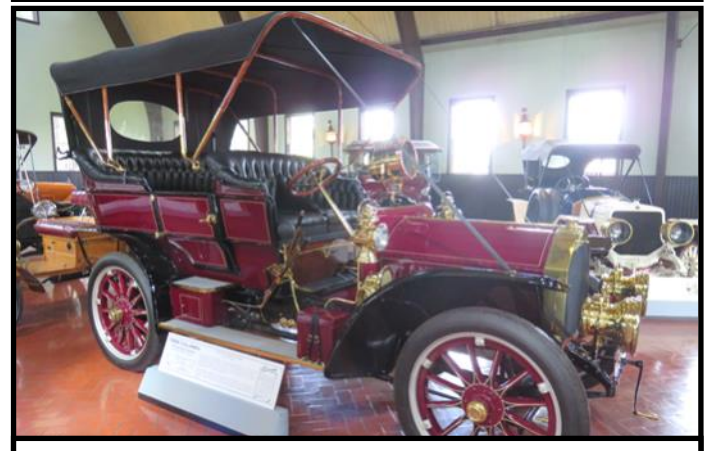
1906 Columbia 5-passenger Touring Car (on loan to the museum)