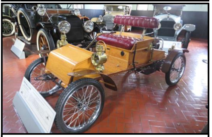
1906 Waltham Orient Buckboard