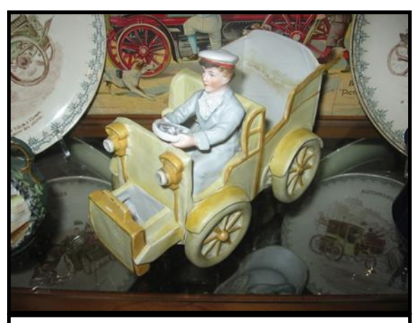
Bisque smokers desk-piece. Rear seat held cigars, front compartment held matches which were lighted by scraping across the serrated radiator core.

This is a delightful motoring figurine depicting a typical motoring hazard in the early 1900s. Possibly French, circa 1908. This example was found at Hershey several years ago.