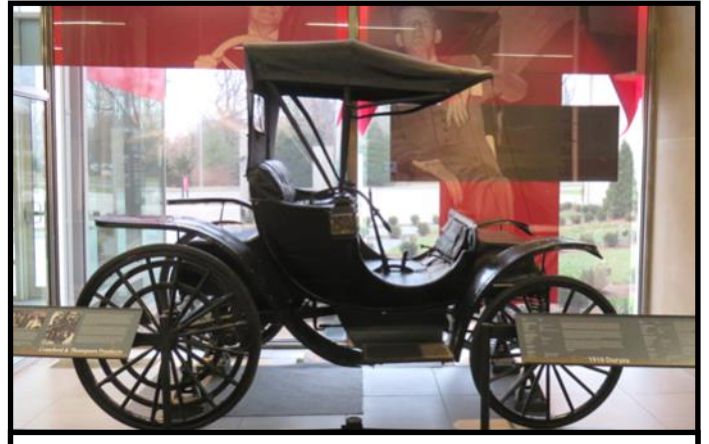
1910 Duryea—the car that started the Crawford Collection

On the lower level is a diverse collection of vehicles from various manufacturers from across America and even some foreign vehicles. The exhibit highlights technology and design in the automotive industry from the late 1800s to the Twenty-First Century. Some of the vehicles found on the lower level