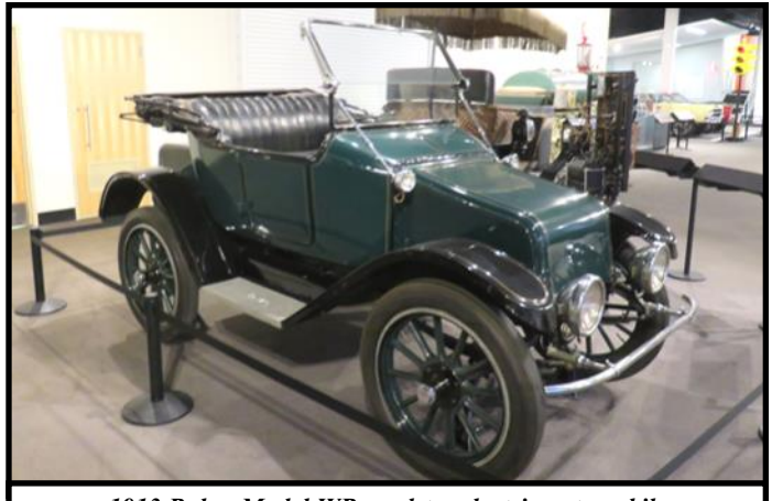
1913 Baker Model WB roadster electric automobile