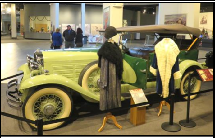
1929 Jordan Model G "Speedboy" Dual-Cowl Phaeton