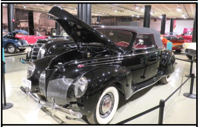
1939 Lincoln Zephyr Model H-76