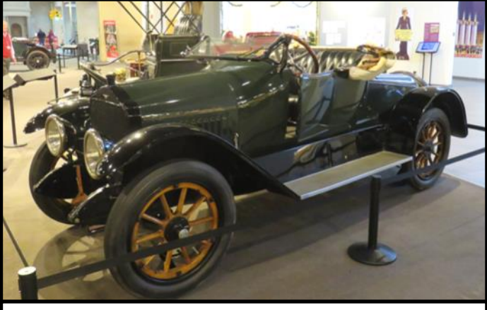
1915 White Model 30