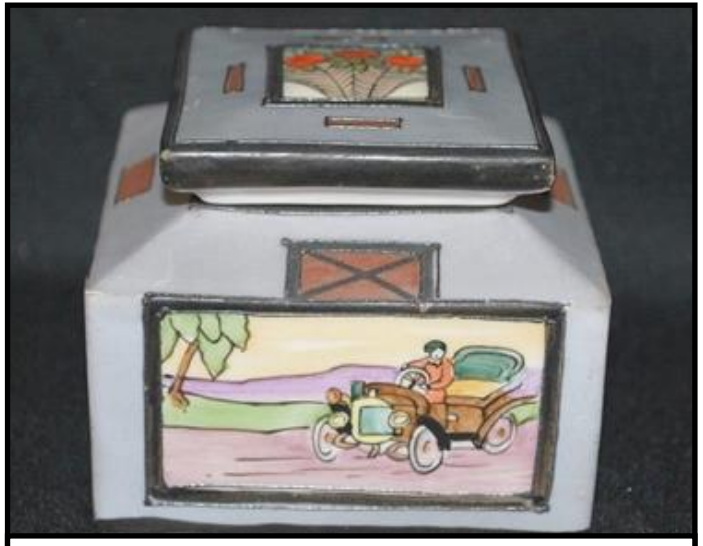
Nippon porcelain inkwell with hand-painted early auto scene

Some collecting advice: I've come to value networking with other collectors and dealers. It helps to understand