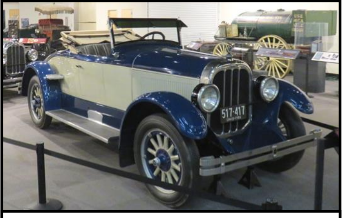
1933 Chandler-Cleveland Model 33A Comrade roadster