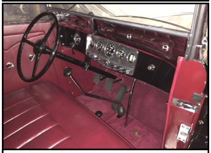
The Auburn's luxurious art deco interior