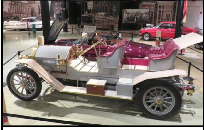
1909 Simplex Model 90 Double-Roadster by Holbrook

include three stainless steel body cars and, one of the curator's favorite vehicles, a 1939 Lincoln Zephyr.