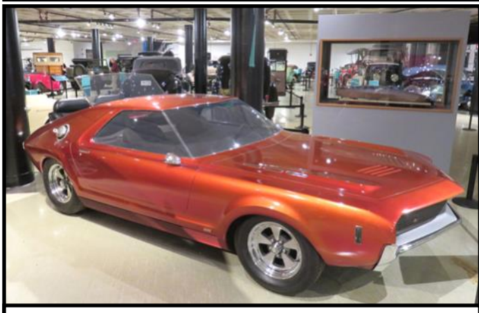
1966 AMC Prototype AMX