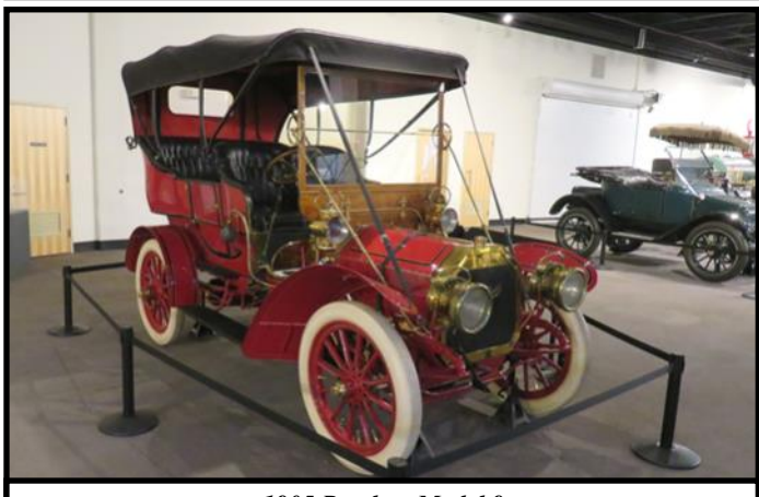
1905 Peerless Model 9