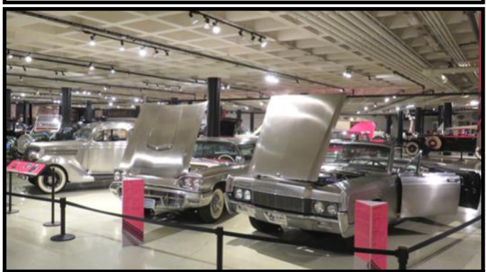
(L-R) Three special stainless steel cars produced by the Allegheny Ludlum Steel Corp. for Ford Motor Company: a 1936 Ford Tudor Deluxe, 1960 Ford Thunderbird, and a 1966 Lincoln Continental