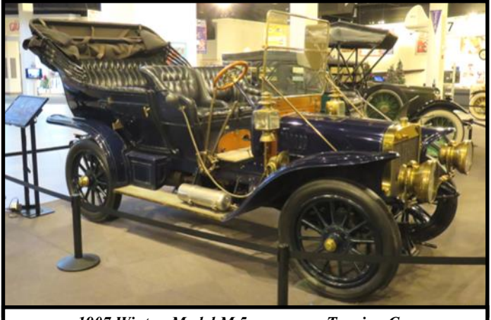
1907 Winton Model M 5-passenger Touring Car