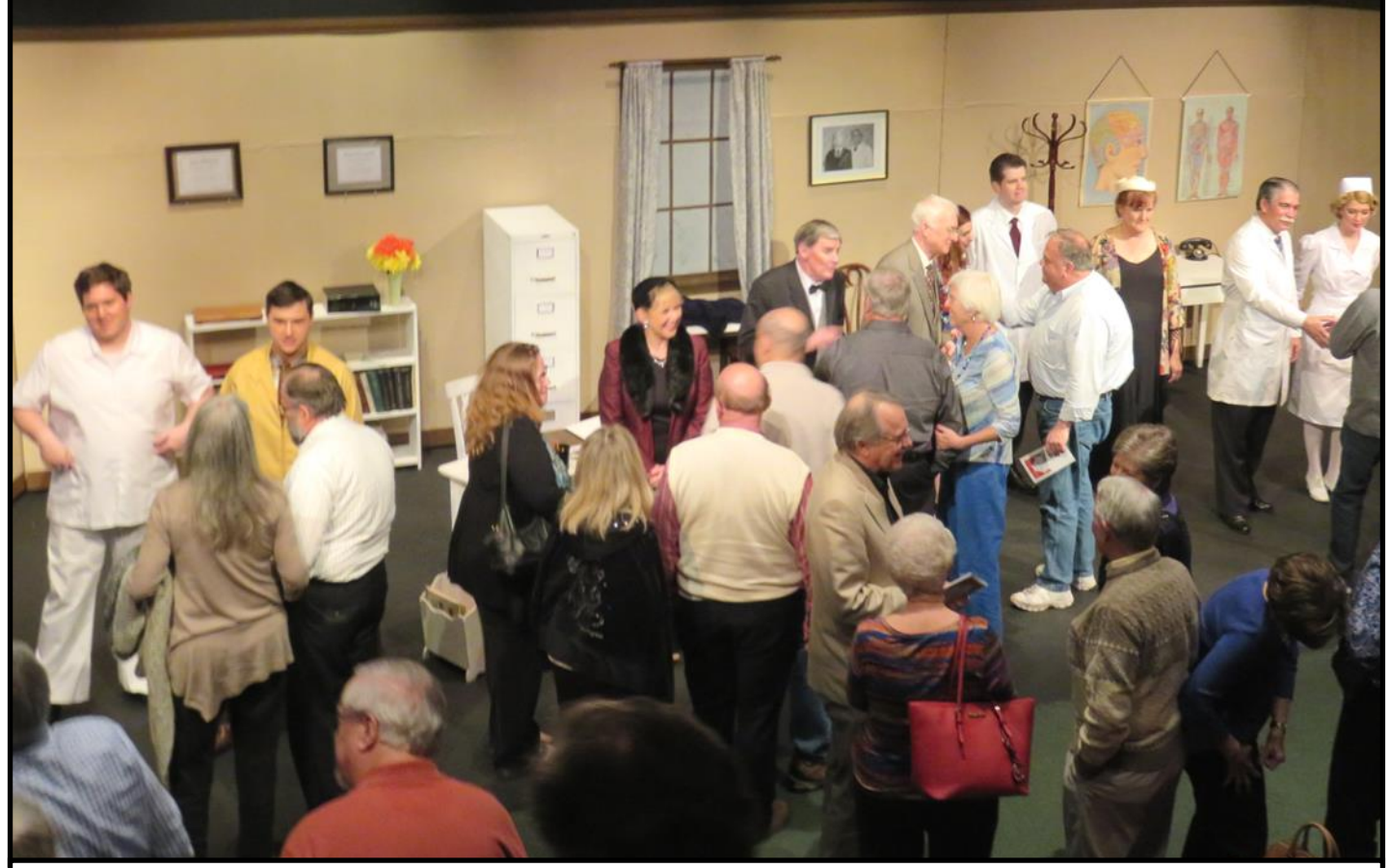
TRAACA members and other members of the audience interacting with the cast of "Harvey" after the play. (Harvey had stepped out.)