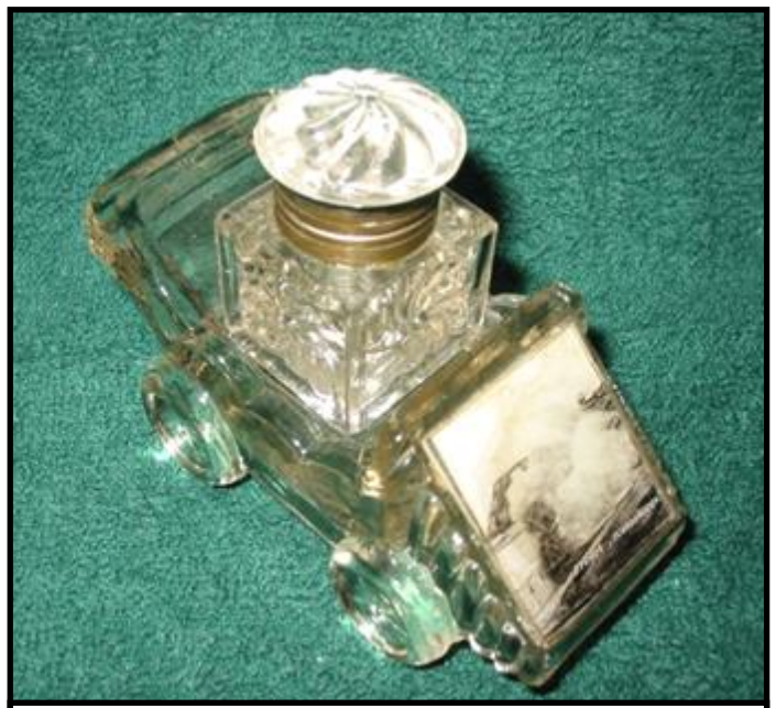
Vintage glass car with inkwell and souvenir photo—circa 1907. Value $150.

There are some types of inkwells that are fairly common, especially the large race car in silver plate. The price range is $700-$2,500 with the condition and size of the object being the determining factors. These were available in at least three different sizes. There are few variations on these, and one in particular that is actually signed by the artist. It's a rare and valuable piece.