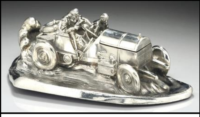
A well-known example of a large silver-plated auto inkwell