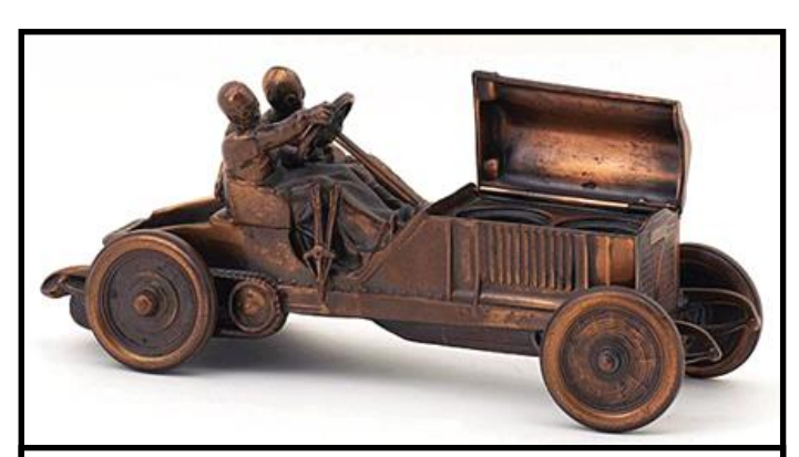
Bronze-plated spelter race car inkwell without a base—circa 1910. Value $300+.