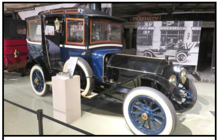
1913 ALCO Model Six Berline Limousine

If you are ever in the Midwest and have time, stop and visit the Crawford Auto-Aviation Museum. You will not be disappointed. When you check in at the entrance desk, be sure to mention you are part of the AACA, you may get a private tour.