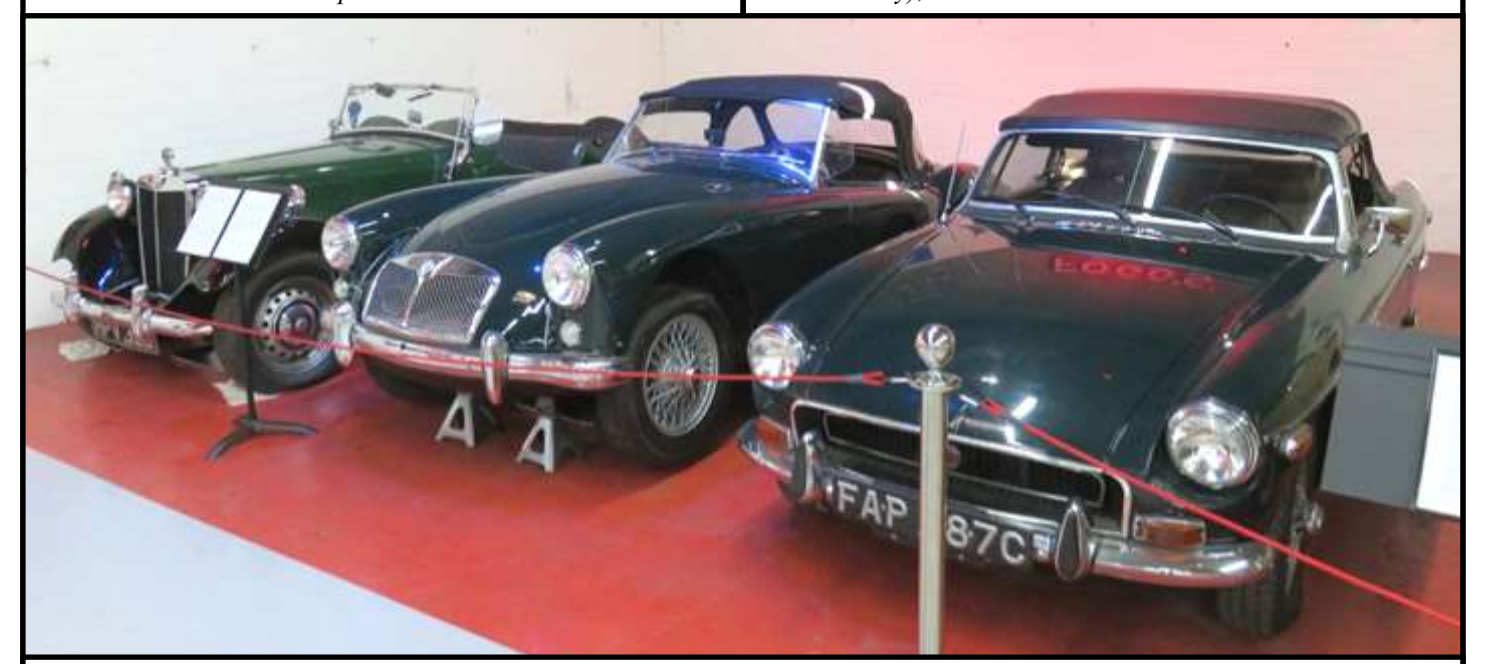
(L-R) Triple green—a 1952 MG TD, 1958 MG MGA, and 1972 MG MGB on display at the Tucson Auto Museum in Tucson, AZ

If you ever visit Tucson, visit the Pima Air & Space Museum, tour the U.S. Air Force "Boneyard," explore the Saguaro National Forest, definitely eat at El Charro's Café (the oldest, continuously family-operated Mexican restaurant in the country), and don't miss the Tucson Auto Museum.