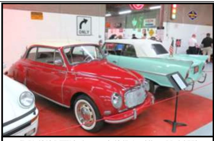
(L-R) 1958 DKW 3=6 coupe & 1967 Amphibcar Model 770