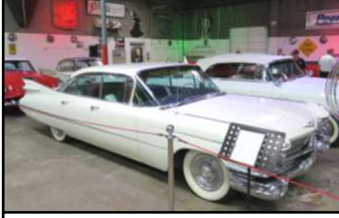
1959 Cadillac Sedan DeVille