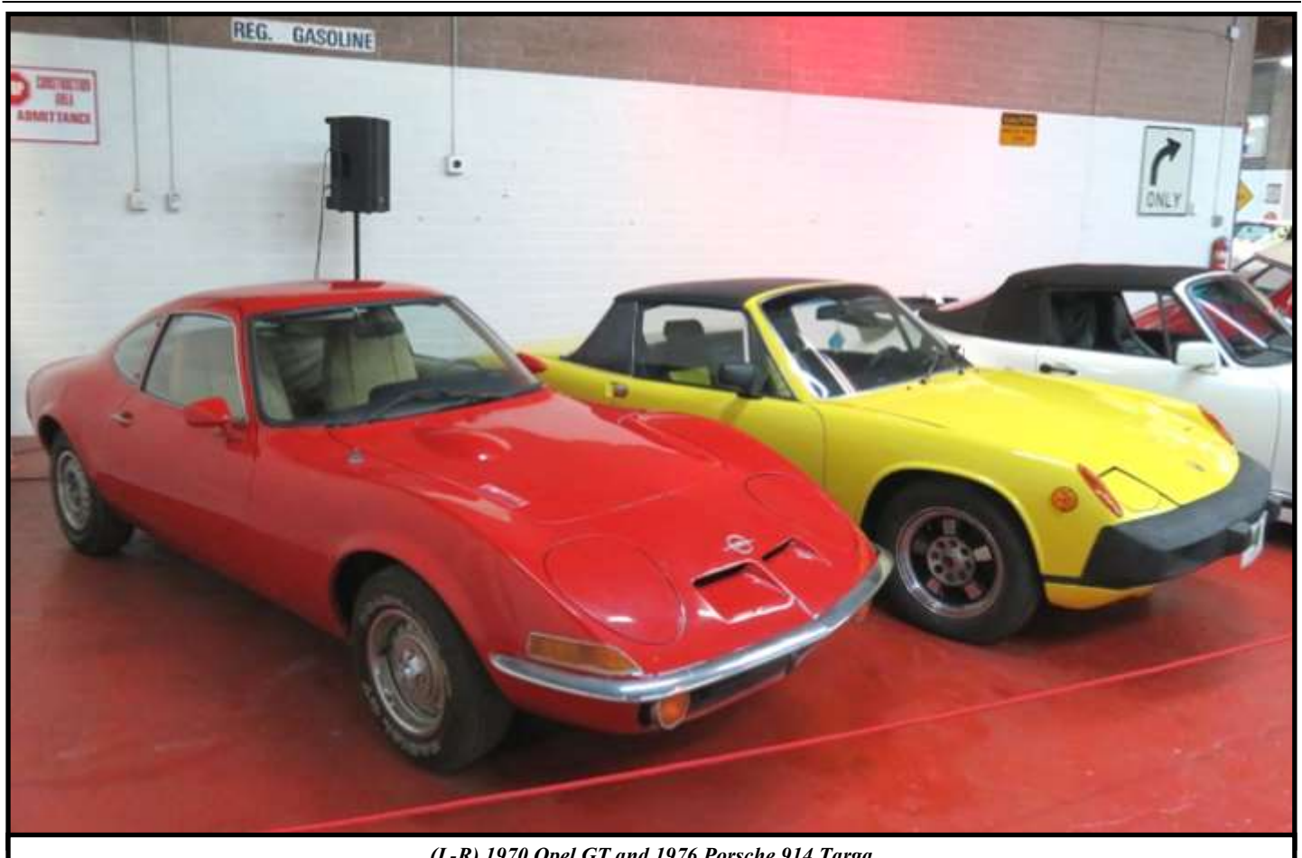
(L-R) 1970 Opel GT and 1976 Porsche 914 Targa