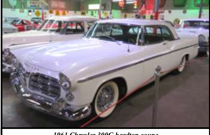
1961 Chrysler 300G hardtop coupe