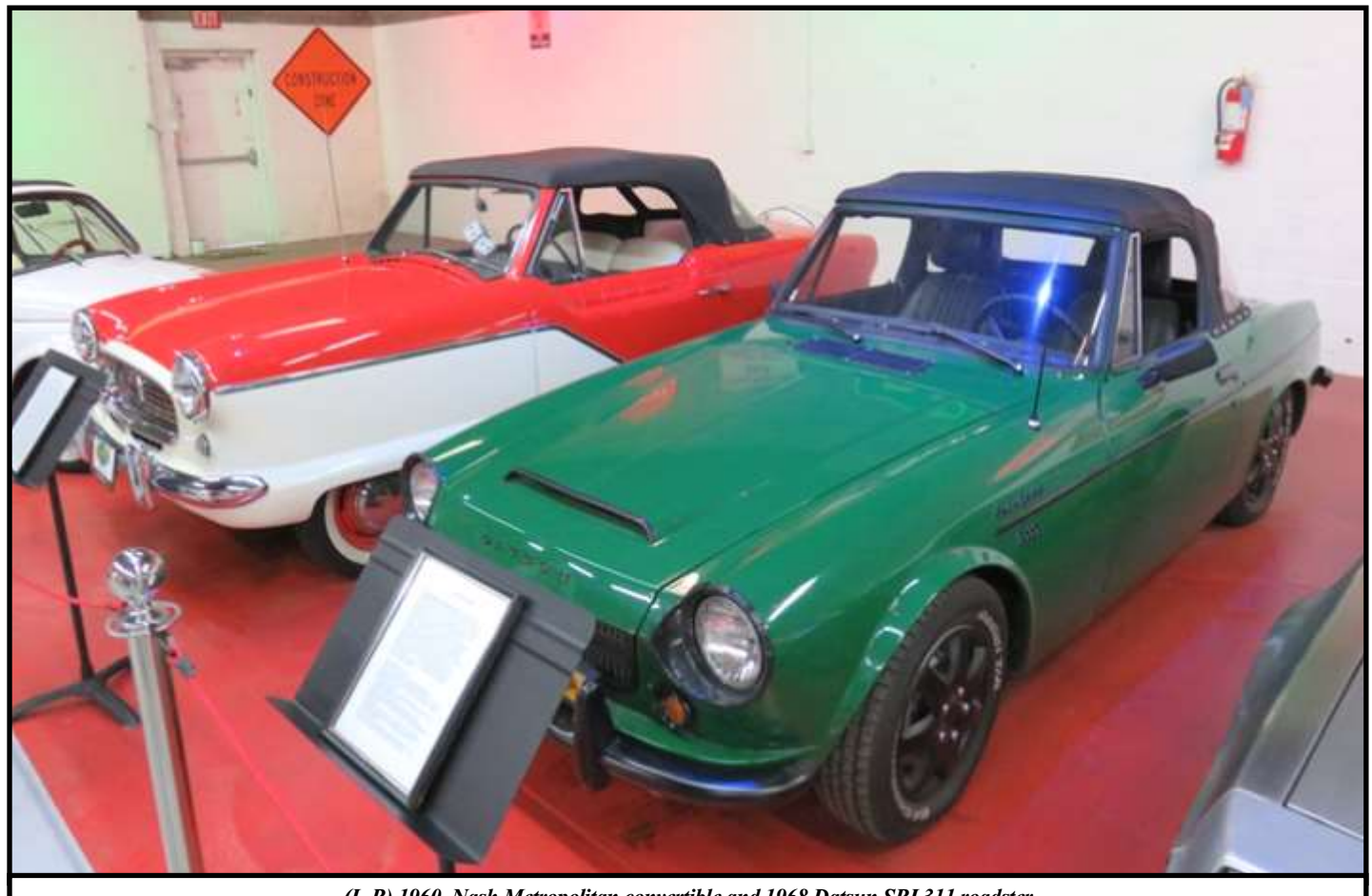
(L-R) 1960 Nash Metropolitan convertible and 1968 Datsun SRL311 roadster