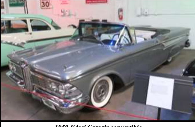
1959 Edsel Corsair convertible