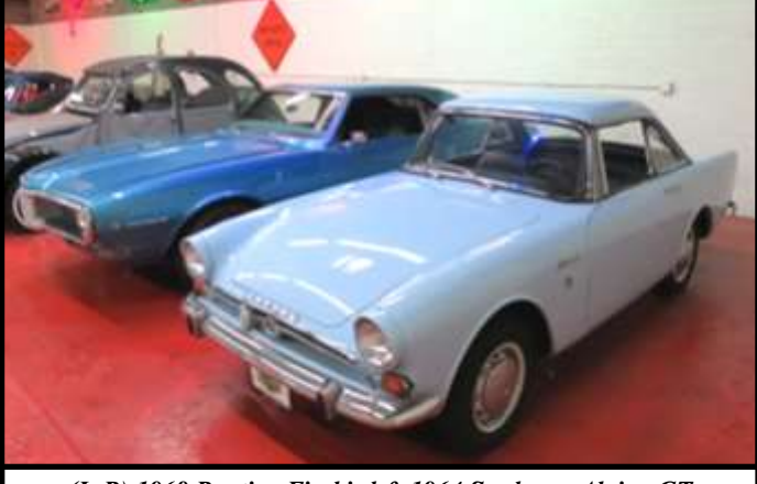
(L-R) 1968 Pontiac Firebird & 1964 Sunbeam Alpine GT